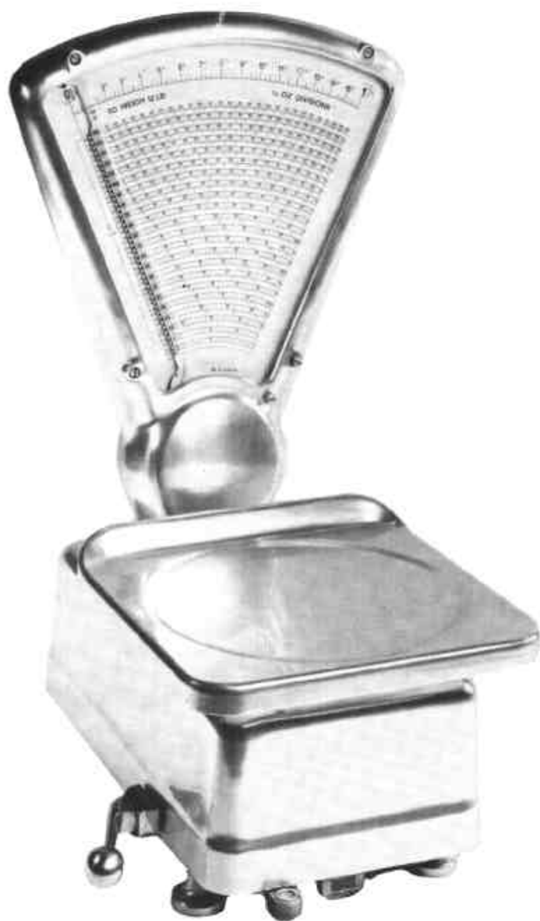
Bizerba Model US12