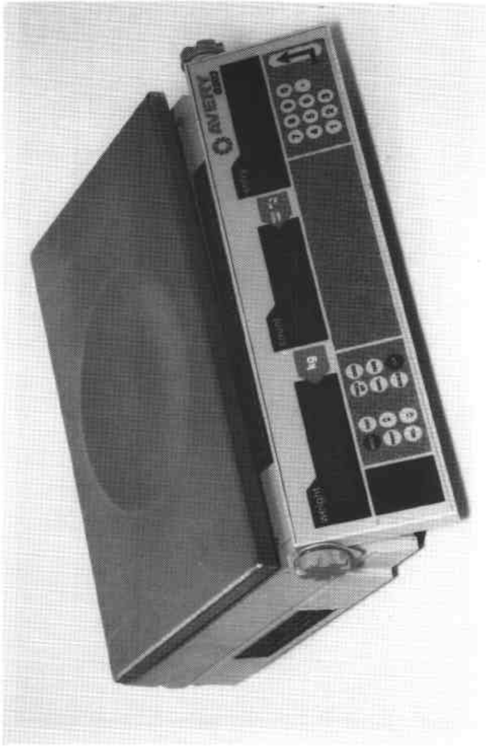
GEC Avery Model G203 Weighing Instrument