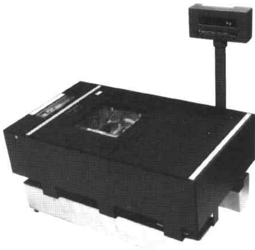
Toledo Model 8215 Weighing Instrument