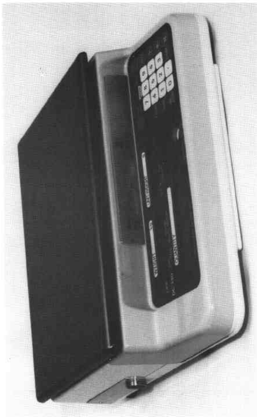
Teraoka Seiko Model DC-130 Weighing Instrument