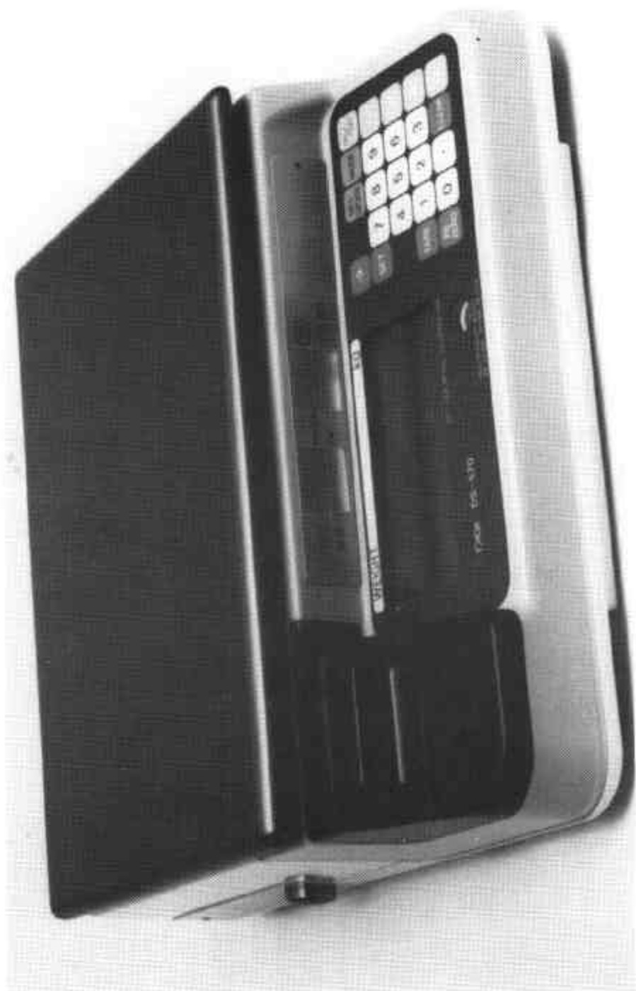
Teraoka Seiko Model DS-570 Weighing Instrument