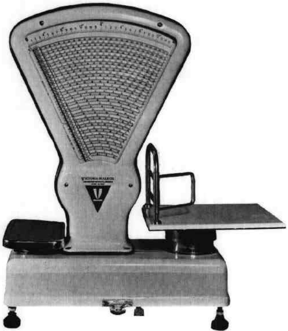
Victoria Model GW30