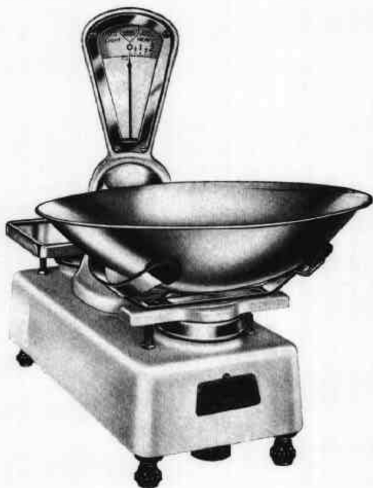
Brecknell Protector Scale Model 73