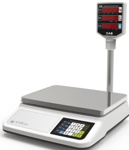
CAS Model PRII-EP Weighing Instrument (Variant 1)