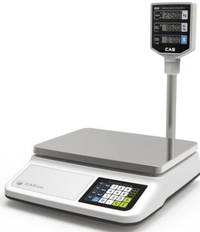
CAS Model PRII-CP Weighing Instrument (Pattern)