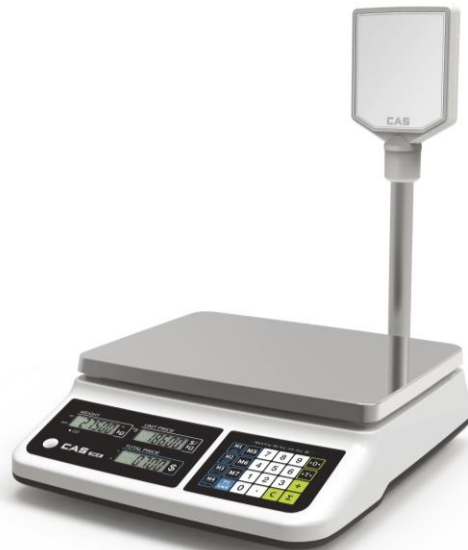
CAS Model PR11-CU Weighing Instrument (Variant 4)