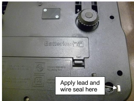
(a) Sealing Arrangements – Lead and Wire Type (Housing)