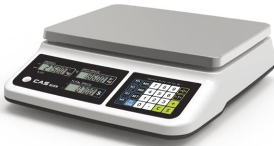
CAS Model PRII-CB Weighing Instrument (Variant 2)