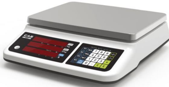
CAS Model PR11-EB Weighing Instrument (Variant 3)