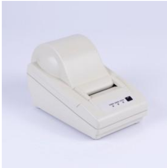
CAS Model DEP-50 Printer