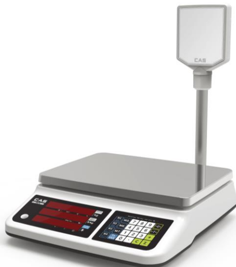
CAS Model PR11-EU Weighing Instrument (Variant 5)