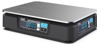
CAS Model PDN-DB Weighing Instrument (Variant 8)