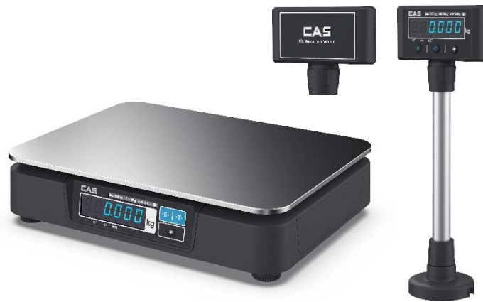
CAS Model PDN-RS Weighing Instrument (Variant 3)