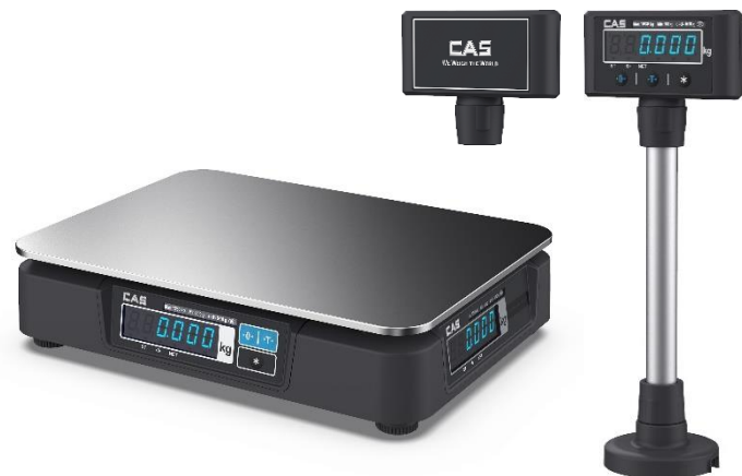
CAS Model PDN-RD Weighing Instrument (Variant 4)