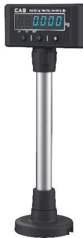
CAS PDN Remote Display