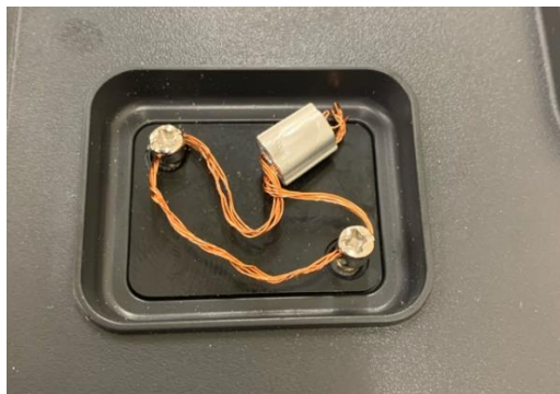
Sealing of PDN Series Instruments