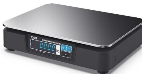
CAS Model PDN-BS Weighing Instrument (Variant 5)