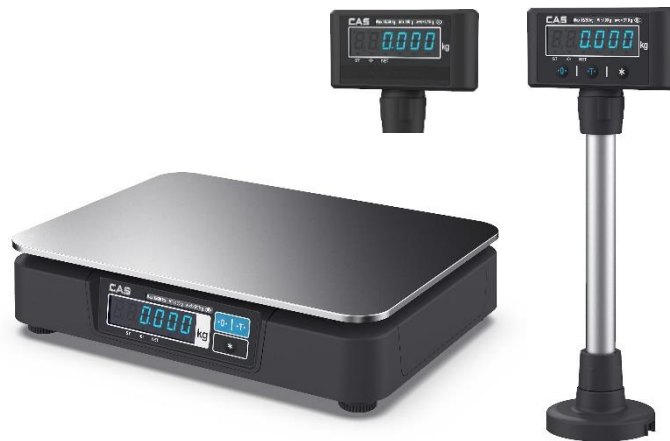
CAS Model PDN-RT Weighing Instrument (Pattern)