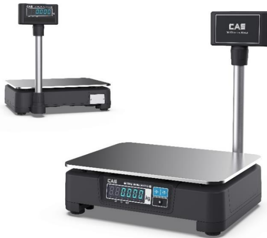
CAS Model PDN-US Weighing Instrument (Variant 7)