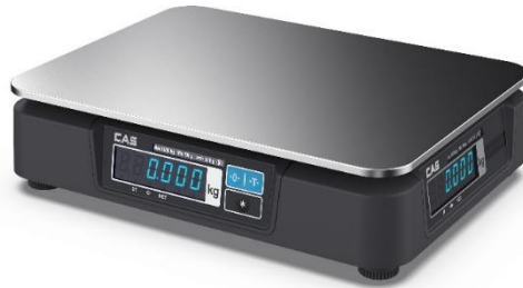
CAS Model PDN-BD Weighing Instrument (Variant 6)