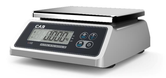
FIGURE 6/4C/321 - 1