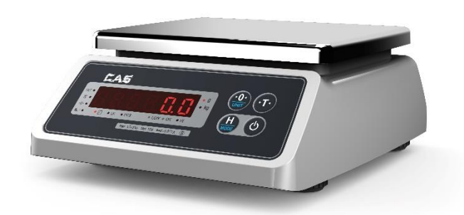
FIGURE 6/4C/321 - 2

CAS Model SWII-EW Weighing Instrument (Variant 3)