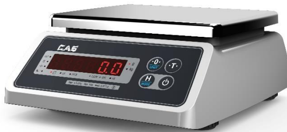
CAS Model SWII-EW Weighing Instrument (Variant 3)