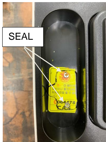
(b) Sealing Arrangements – Destructible Adhesive Label (Cover Plate)