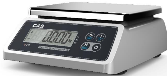
CAS Model SWII-CW Weighing Instrument (Pattern)