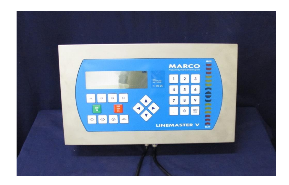
FIGURE 6/4C/317 - 2

Ian Fellows Model Linemaster V Digital Indicator (Variant 2)