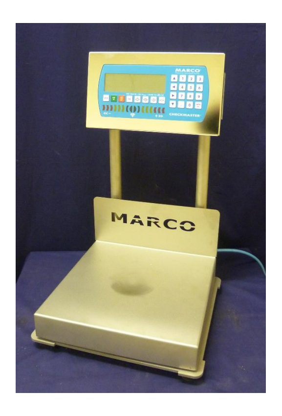
FIGURE 6/4C/317 - 1

(a) MARCO Model Checkmaster Weighing Instrument (Pattern & Variant 1)