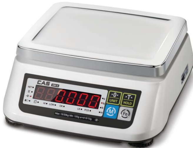
CAS Model SWII-E Weighing Instrument (Variant 3)