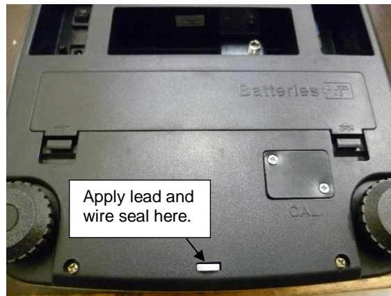
(a) Sealing Arrangements - Lead and Wire Type (Housing)