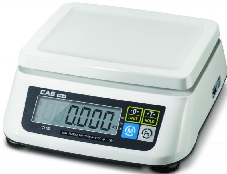
CAS Model SWII-C Weighing Instrument (Pattern)