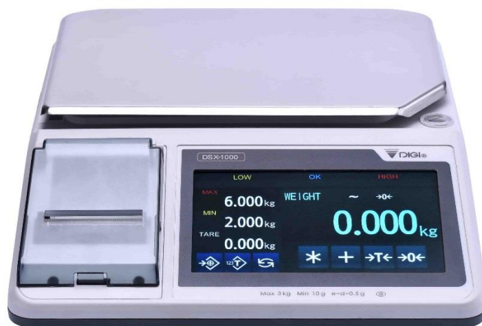
Teraoka Model Digi DSX-1000 Weighing Instrument with an integral printer (Variants 3)