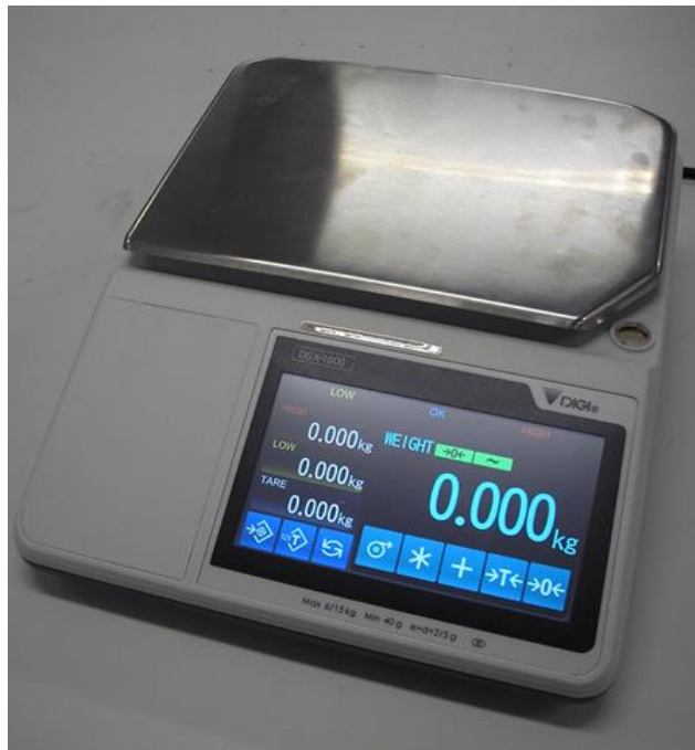
Teraoka Model Digi DSX-1000 Weighing Instrument (Pattern)