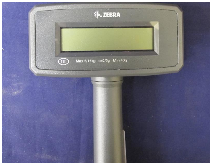
(b) Zebra Technologies Model MX 201 Single Display