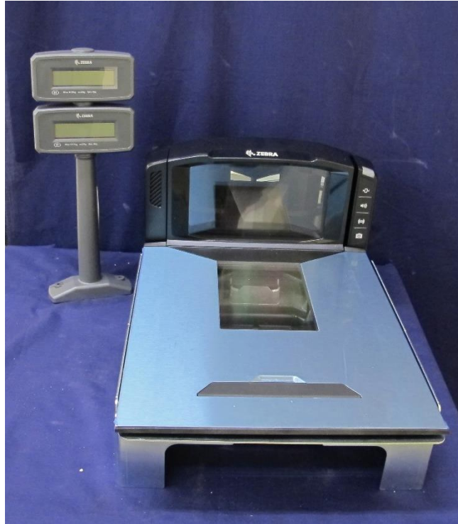
(a) Zebra Technologies Models MP70X1 & MP70X2 Series Weighing Instruments Long Version (Pattern)