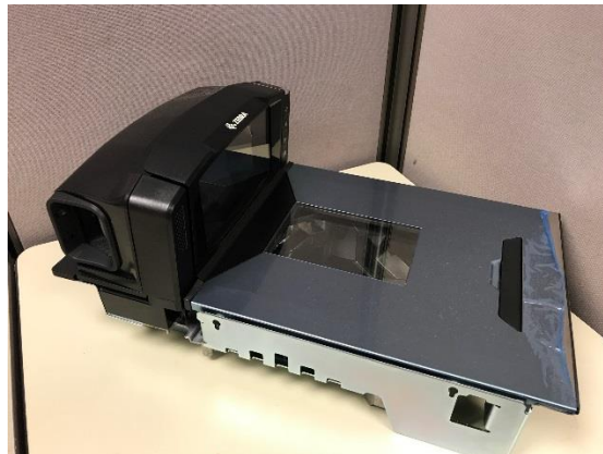
Zebra Technologies Models MP7011 & MP7012 Series With Customer Side Scanner