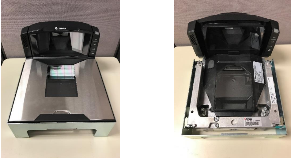
Zebra Technologies Models MP70X1 & MP70X2 Series Weighing Instruments Medium Version (Variant 2)