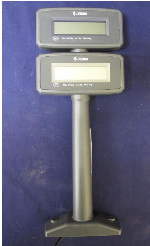
(a) Zebra Technologies Model MX 202 Dual Display