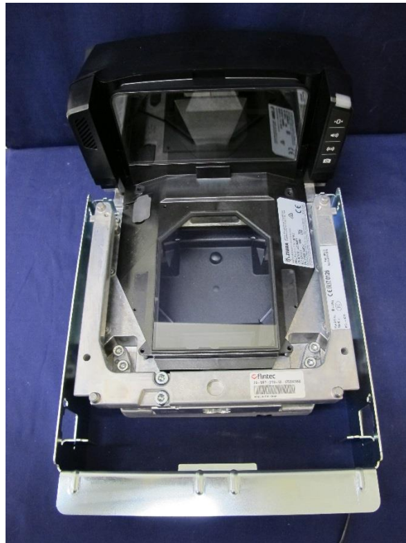
(b) Zebra Technologies Models MP70X1 & MP70X2 Series With Load Receptor Plate Removed (Pattern)