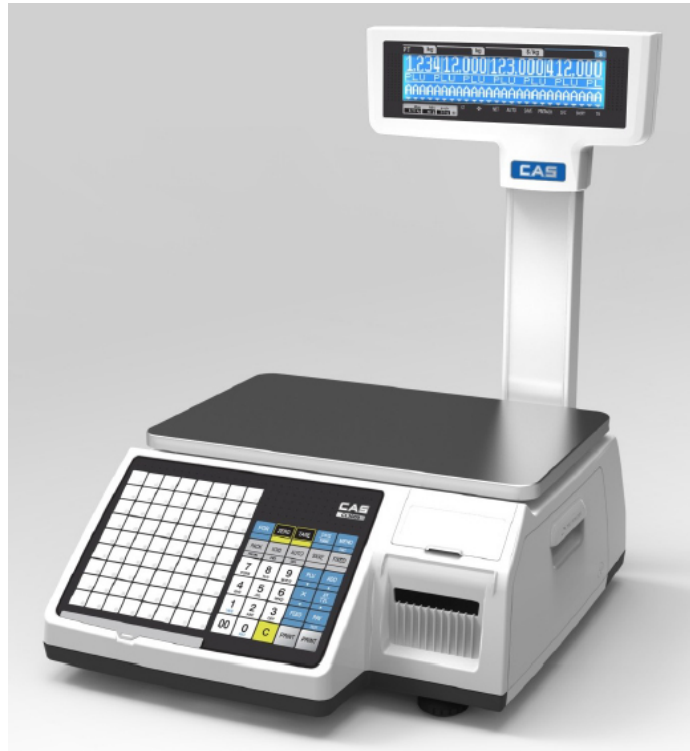
CAS Model CL5200-P Weighing Instrument (pattern)