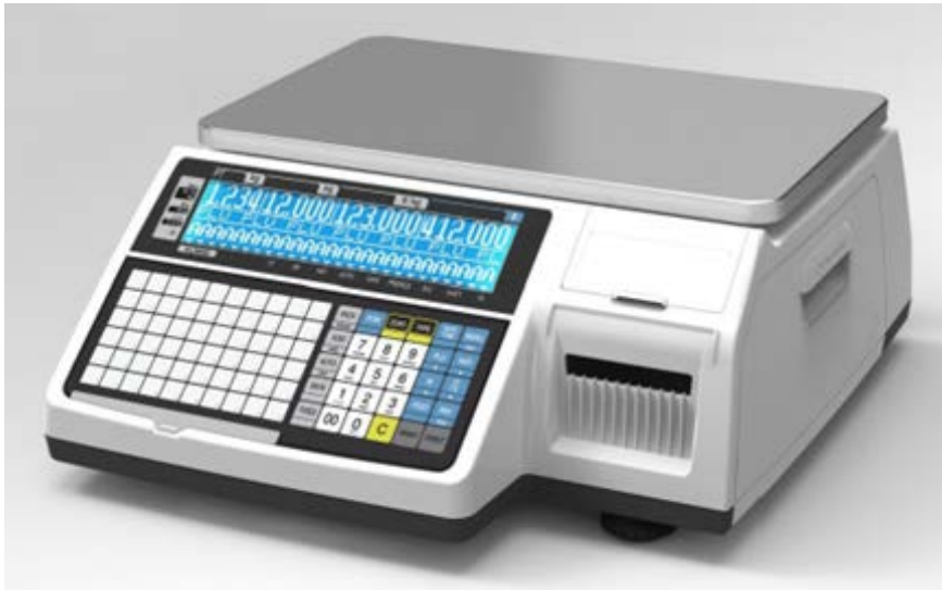
CAS Model CL5200-B Weighing Instrument (variant 2)