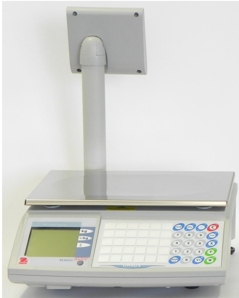
Ohaus Model RS Weighing Instrument (with column-mounted customer display)