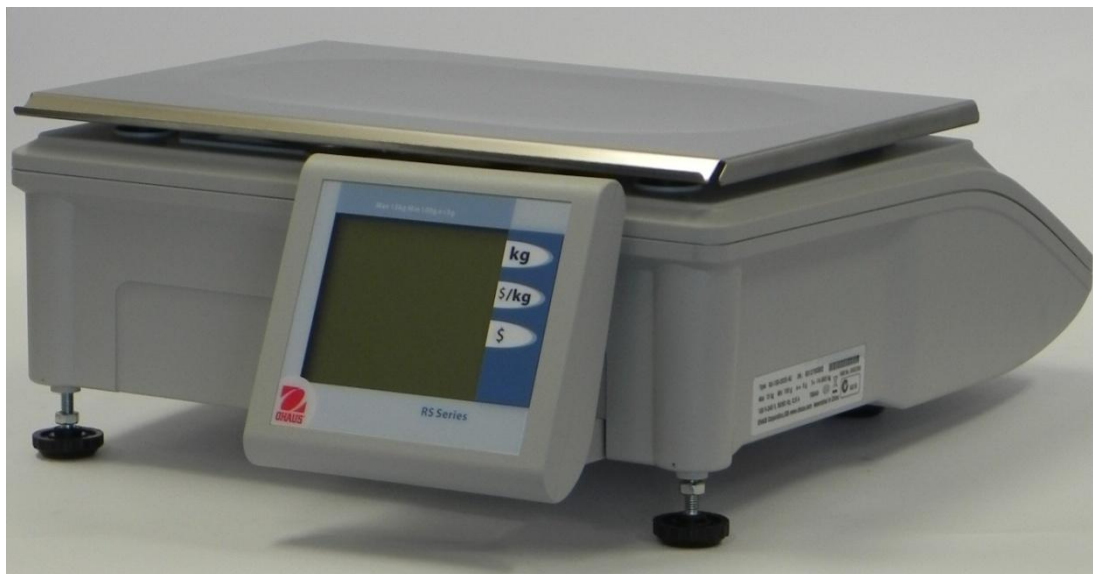
Model RS Weighing Instrument (with customer display directly mounted)