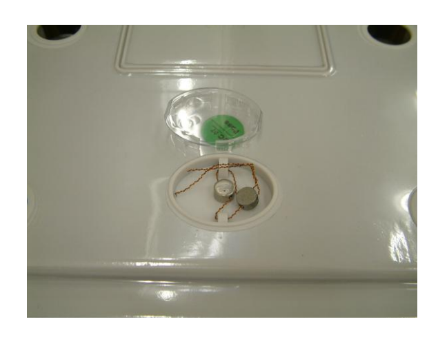
FIGURE 6/4D/350 - 2