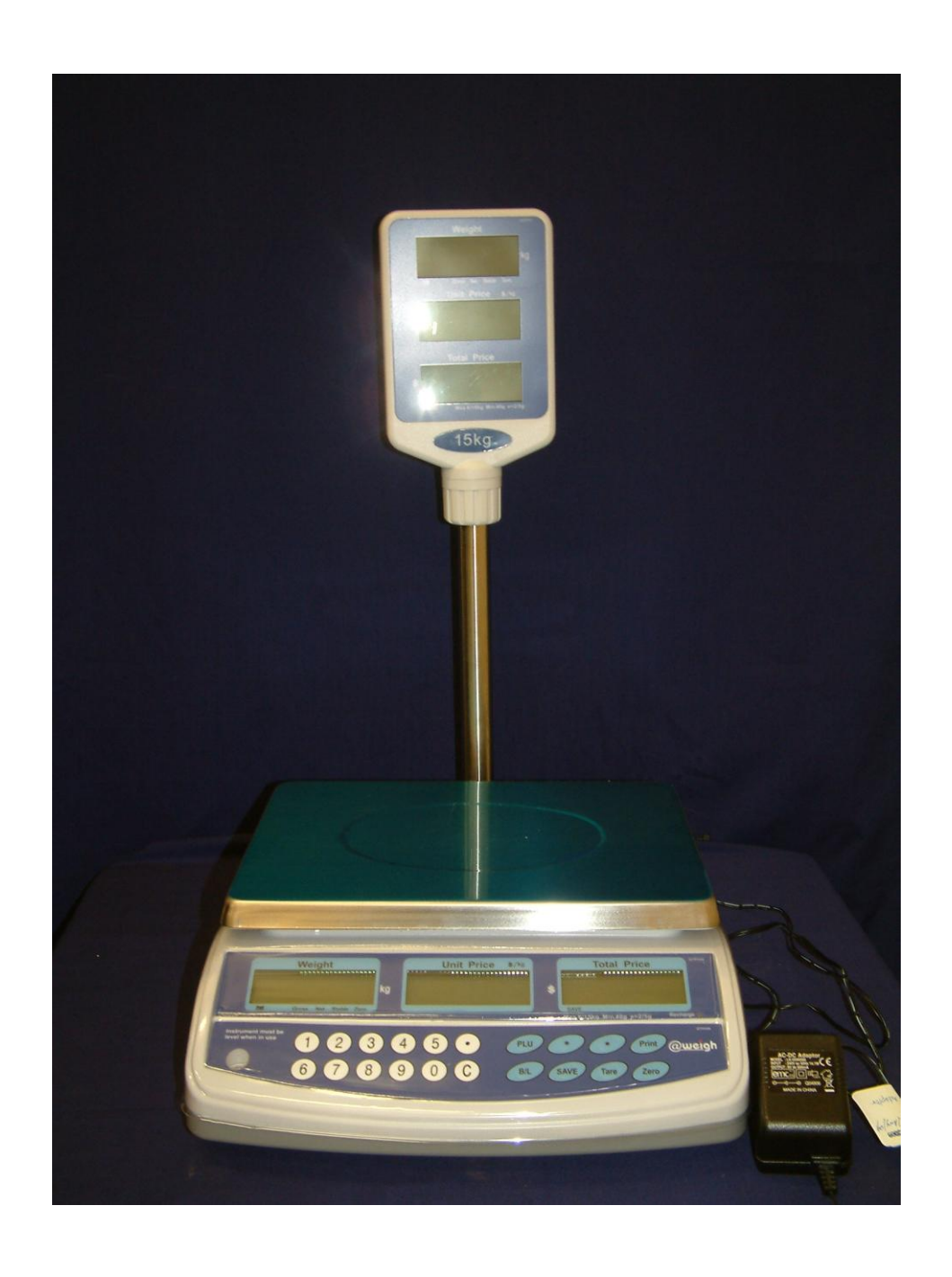
@Weigh Model QSP-15 Weighing Instrument