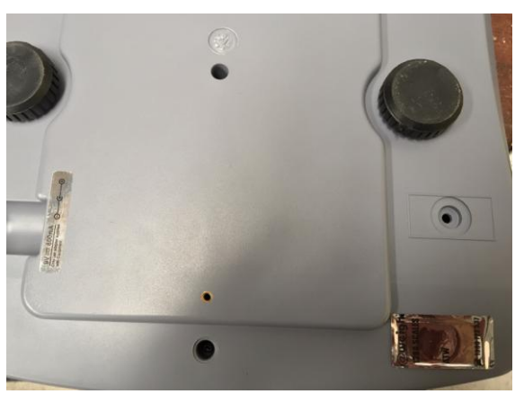
Showing Typical Sealing Methods