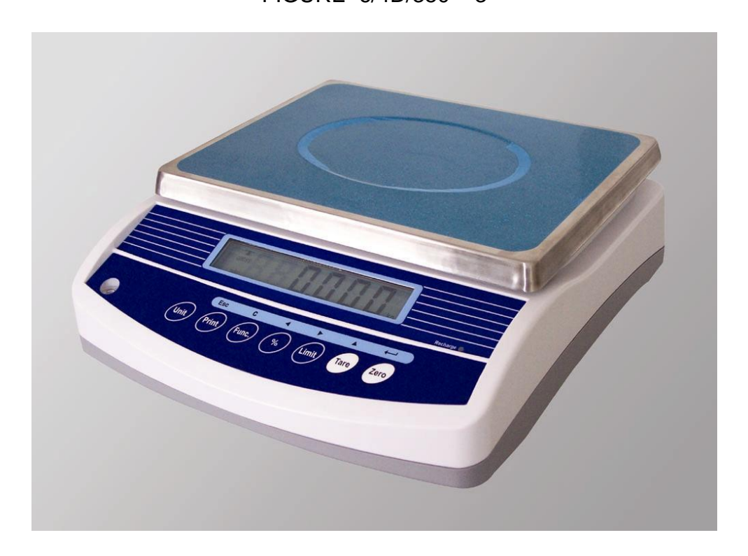
Typical QHW Series Instrument