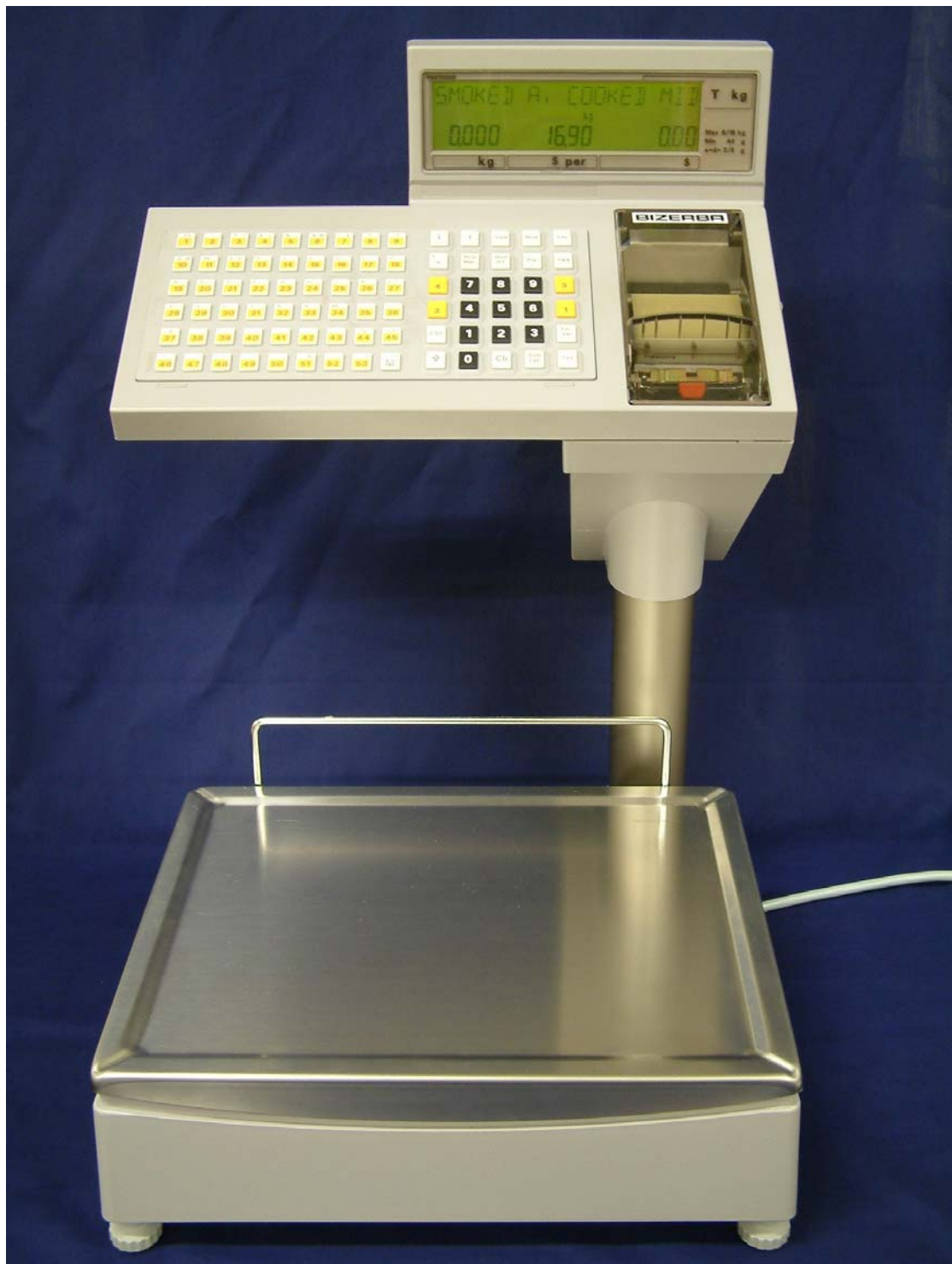
Bizerba Model BS 800 T Weighing Instrument