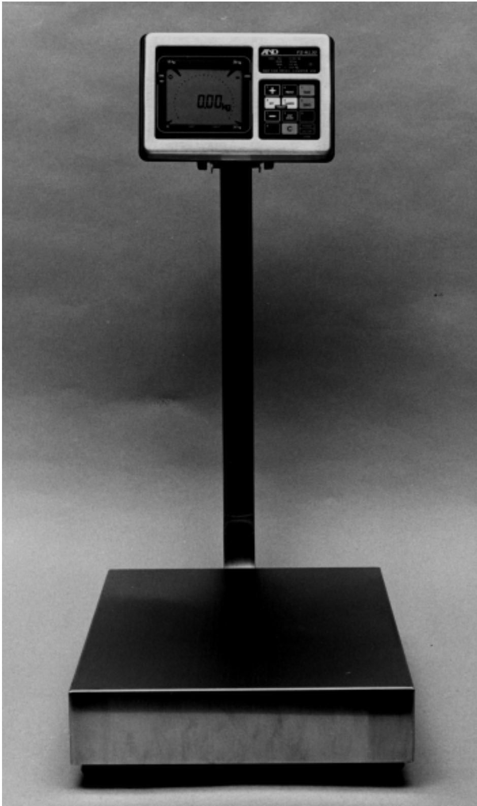
A & D Model FS-KL30 Weighing Instrument