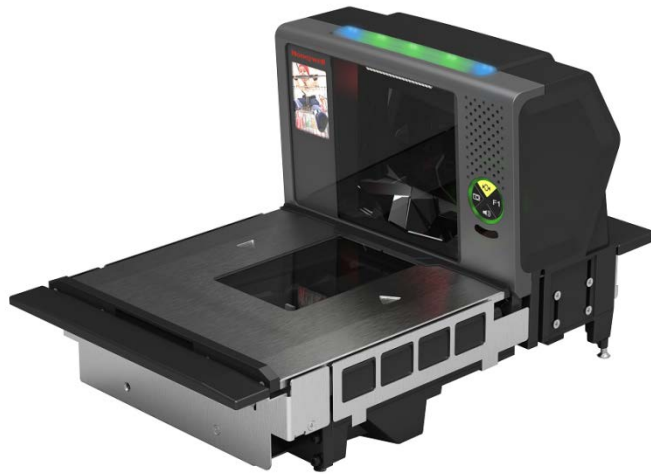
Honeywell Model Stratos 2753 Weighing Instrument (Variant 1)