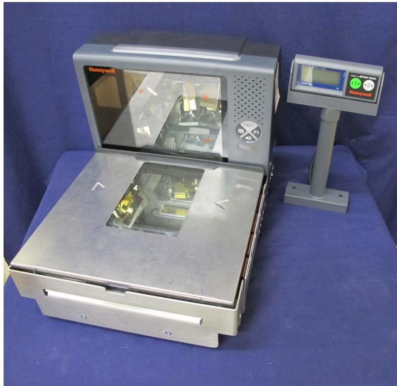
(a) Honeywell Model Stratos 2752 Weighing Instrument (Pattern)