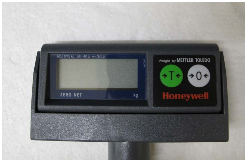
(2b) Honeywell Single Display