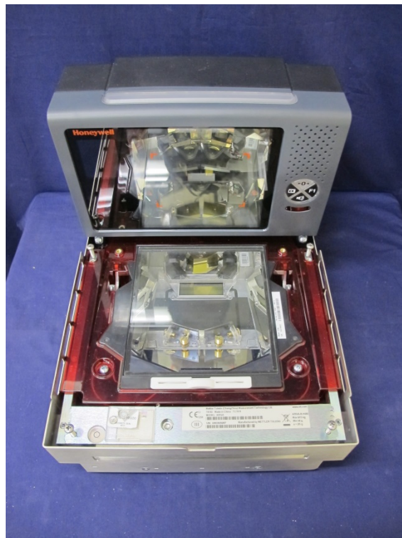
(b) Honeywell Model Stratos 2752 Weighing Instrument With Load Receptor Plate Removed (Pattern)