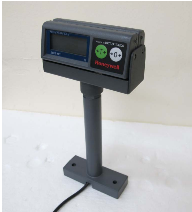
(2a) Honeywell Dual Display