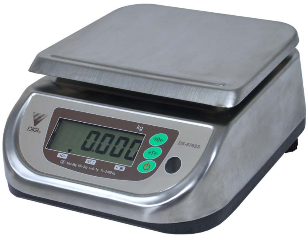
Teraoka Model Digi DS-676SS Weighing Instrument