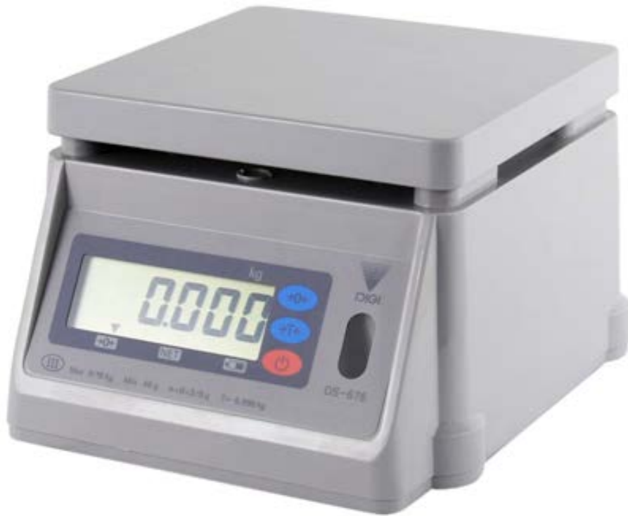
(a) Showing Operator's Display