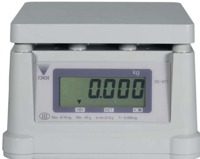
(b) Showing Customers' Display

Teraoka Model Digi DS-676 Weighing Instrument (with standard load receptor)