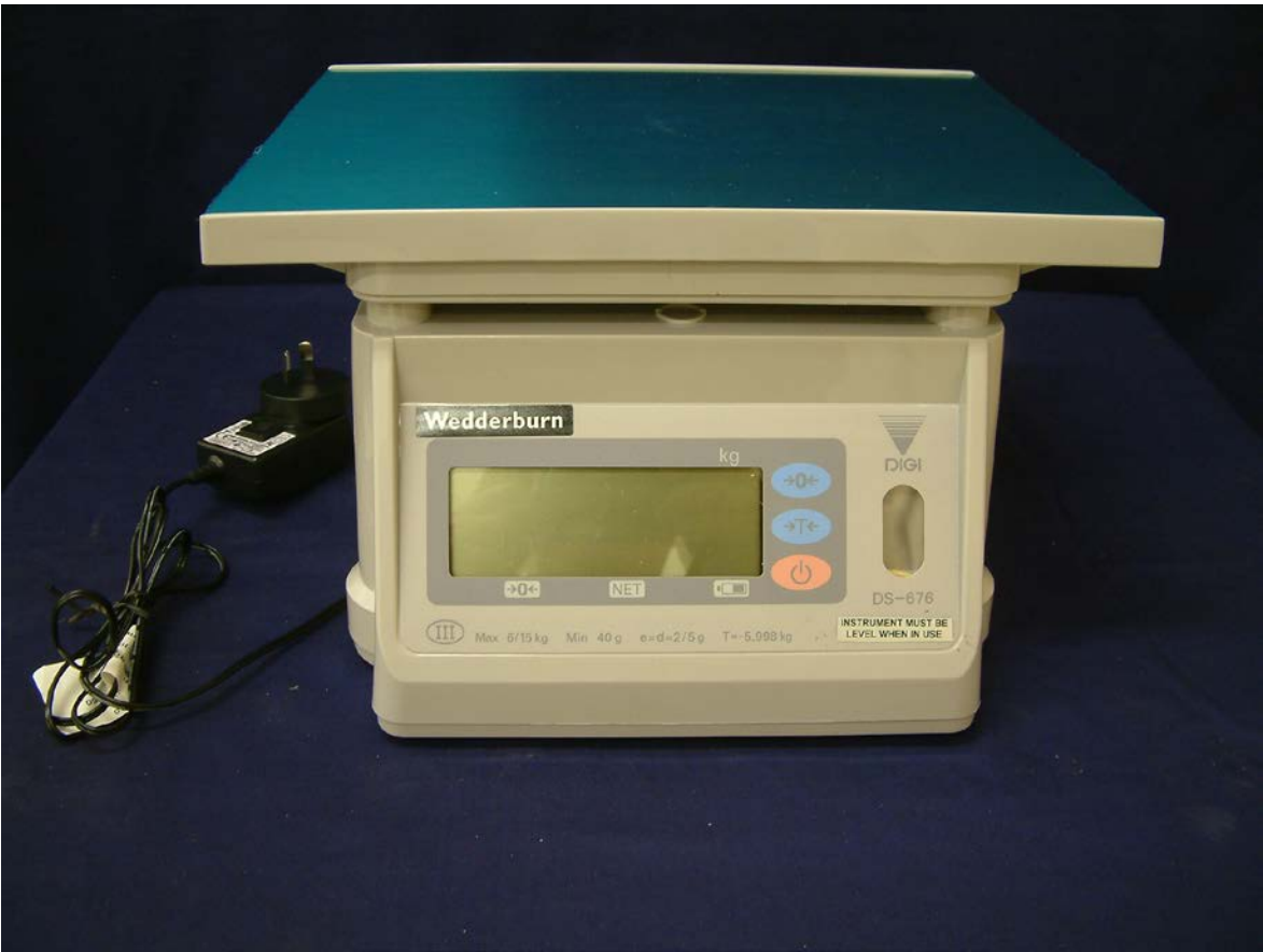
Teraoka Model Digi DS-676 Weighing Instrument (with large platter overlay)