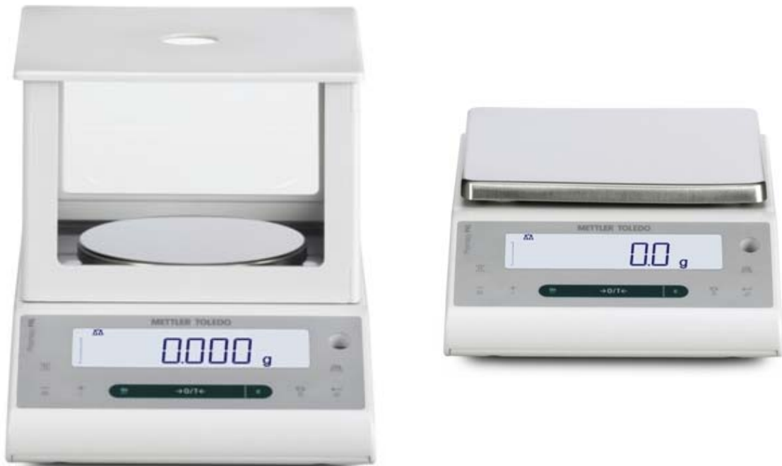
(b) Typical PH*L Series Instruments