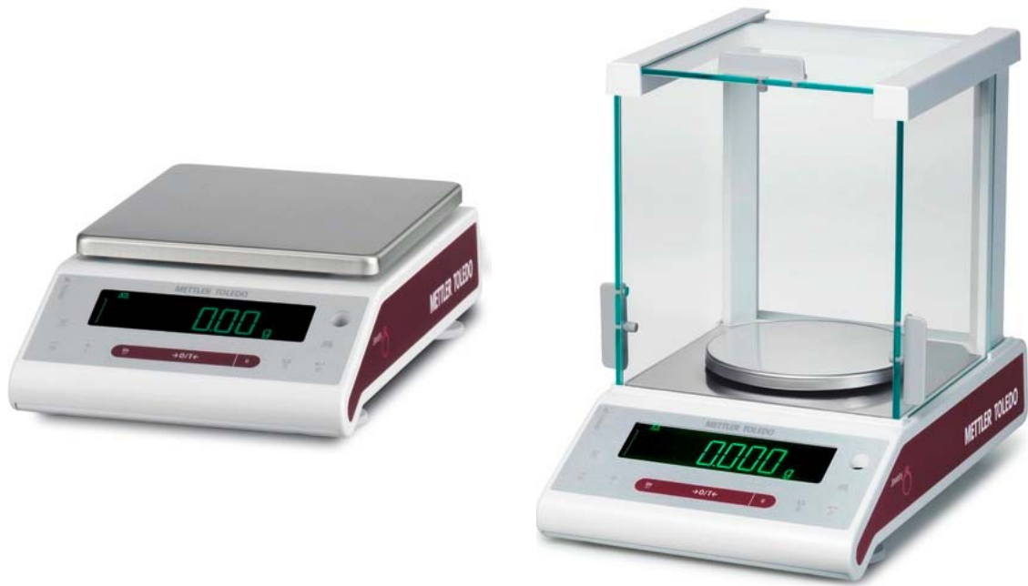
(a) Typical JP Series Instruments