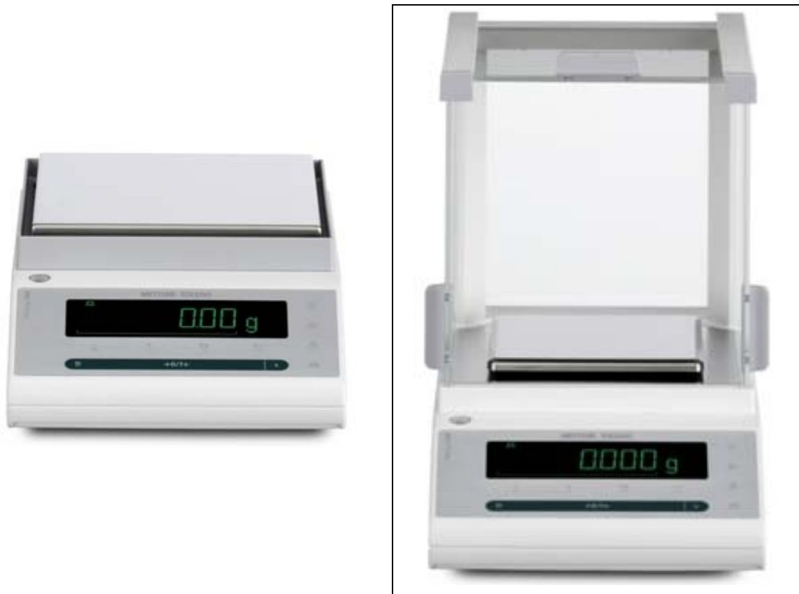
(a) Typical PH*S Series Instruments