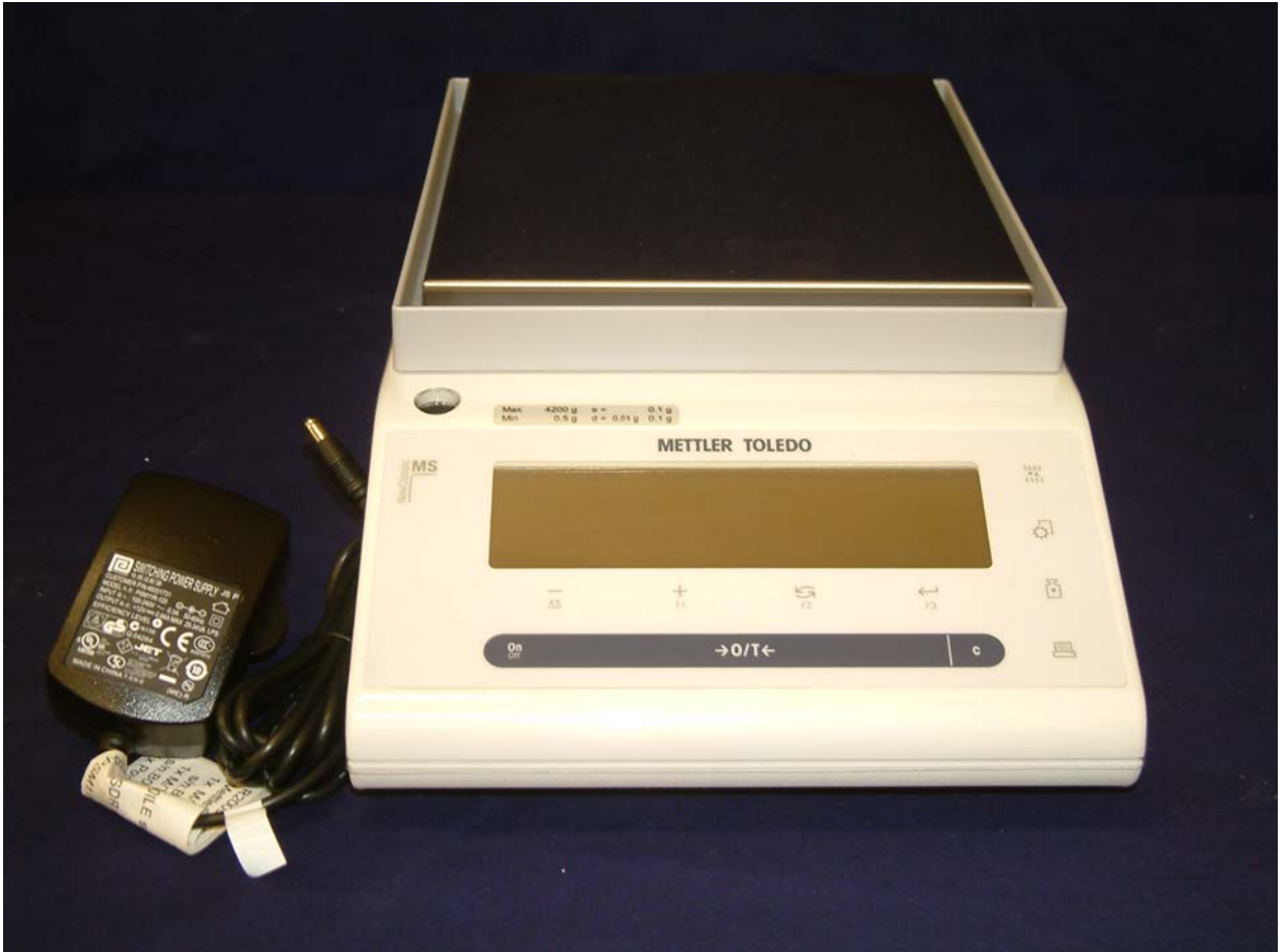
Mettler Toledo Model MS4002SDR Weighing Instrument