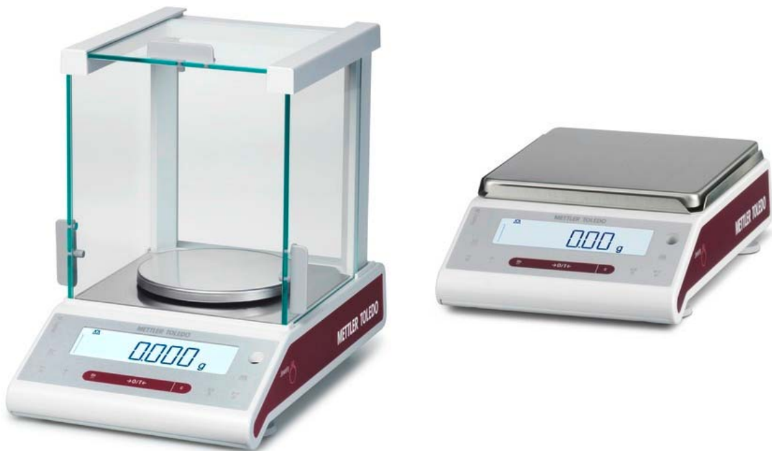
(b) Typical JS Series Instruments