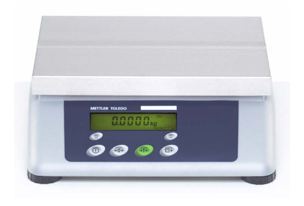
(a) Model BBA422 - ... LA Weighing Instrument