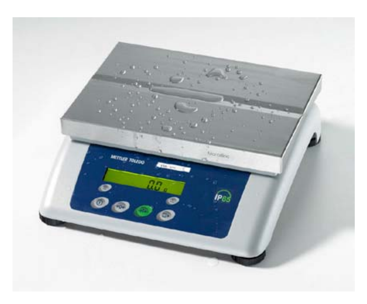
(b) Model BBA425 - ... Weighing Instrument