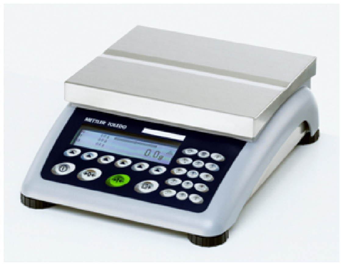
Mettler Toledo Model BBA462-6 SM Weighing Instrument