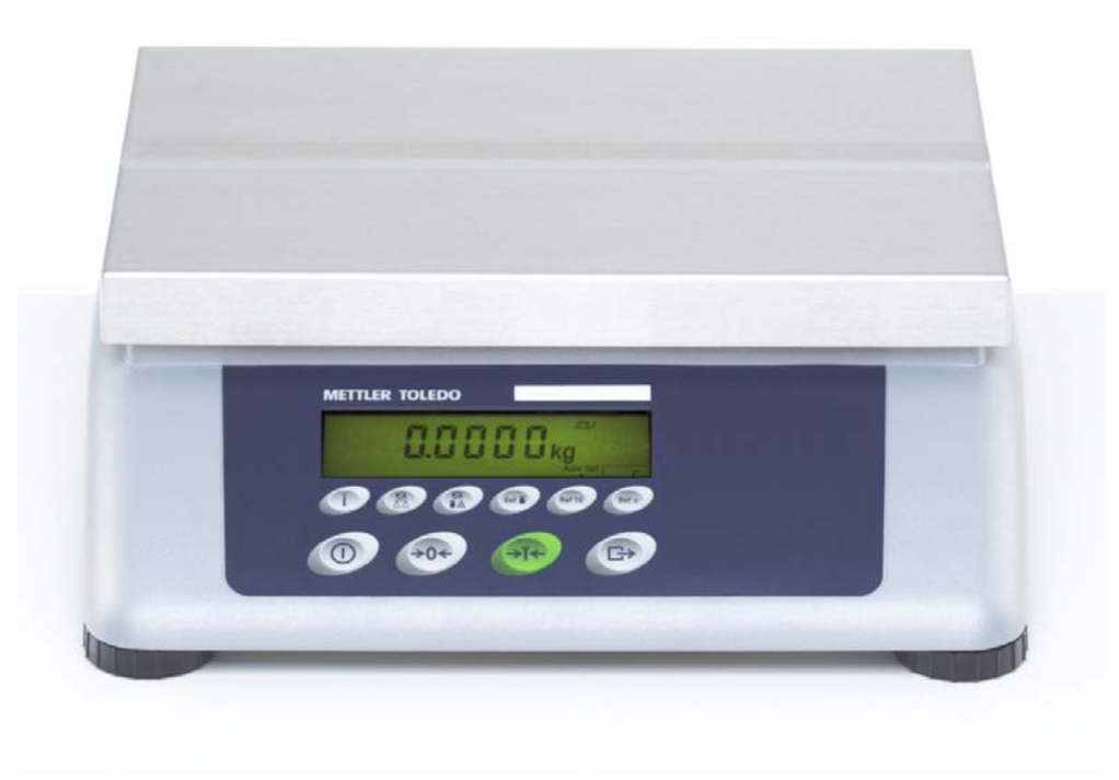
FIGURE 6/4C/246 - 4

(a) Model BBA432 - ... SM Weighing Instrument