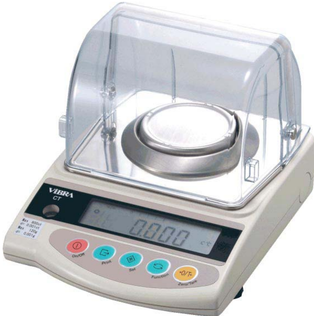
Shinko Denshi Vibra Model CT-600CE Weighing Instrument