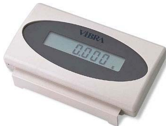
Vibra Model SDI External Display Unit