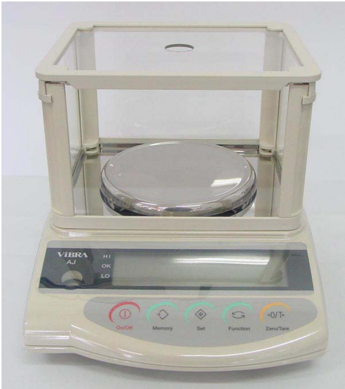
Typical Shinko Denshi Vibra AJ Series Weighing Instrument