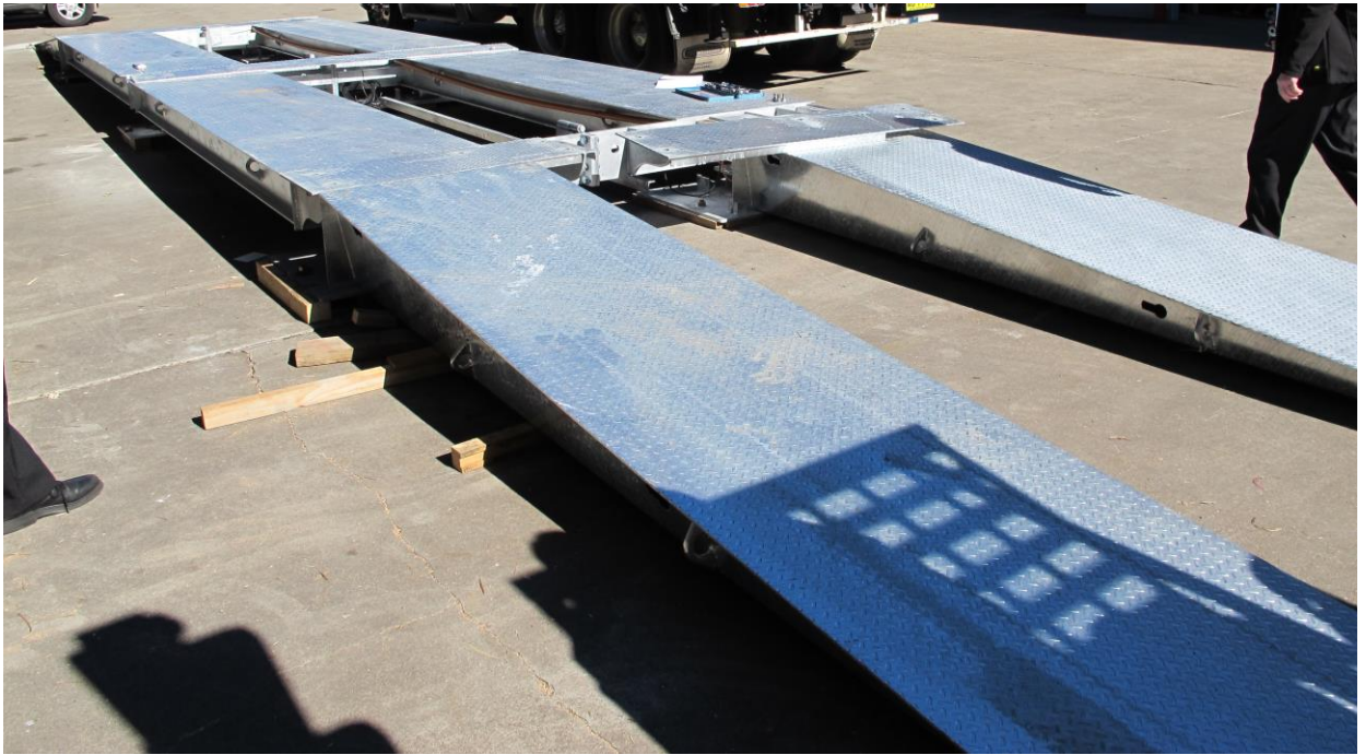
Photograph showing platforms