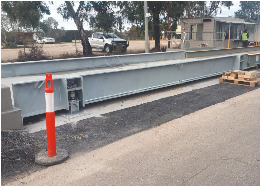
Bilanciai Model SBP/C Titan I-Beam Instrument (Variant 3)