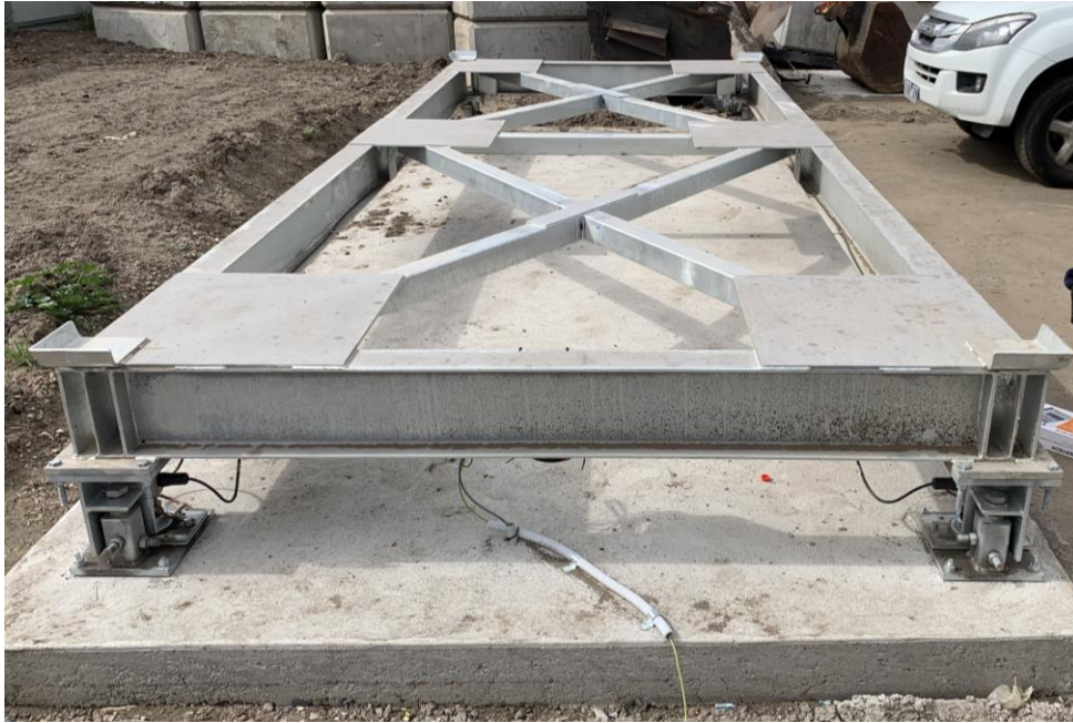
Bilanciai Model SPT-28 Container Weighing Instrument (Variant 4)