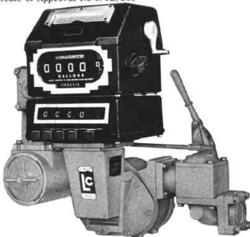
FIGURE 3. Liquid Controls Flowmeter Model M30