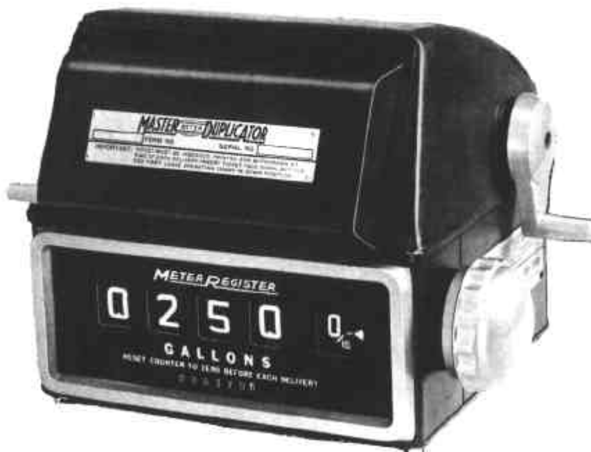
FIGURE 6. Indicating and Printing Device