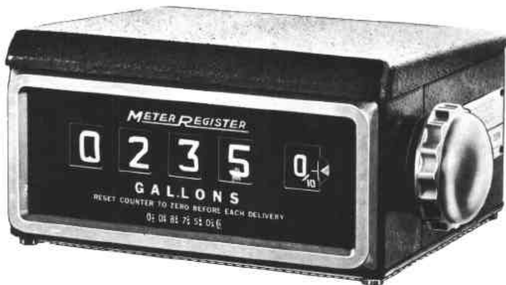
FIGURE 5. Indicating Device