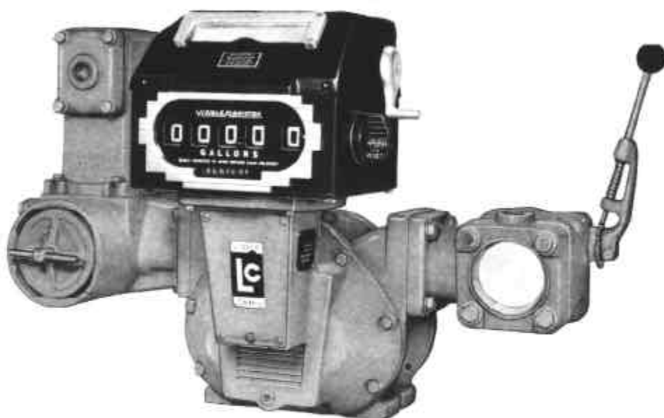
FIGURE 2. Liquid Controls Flowmeter Model M15