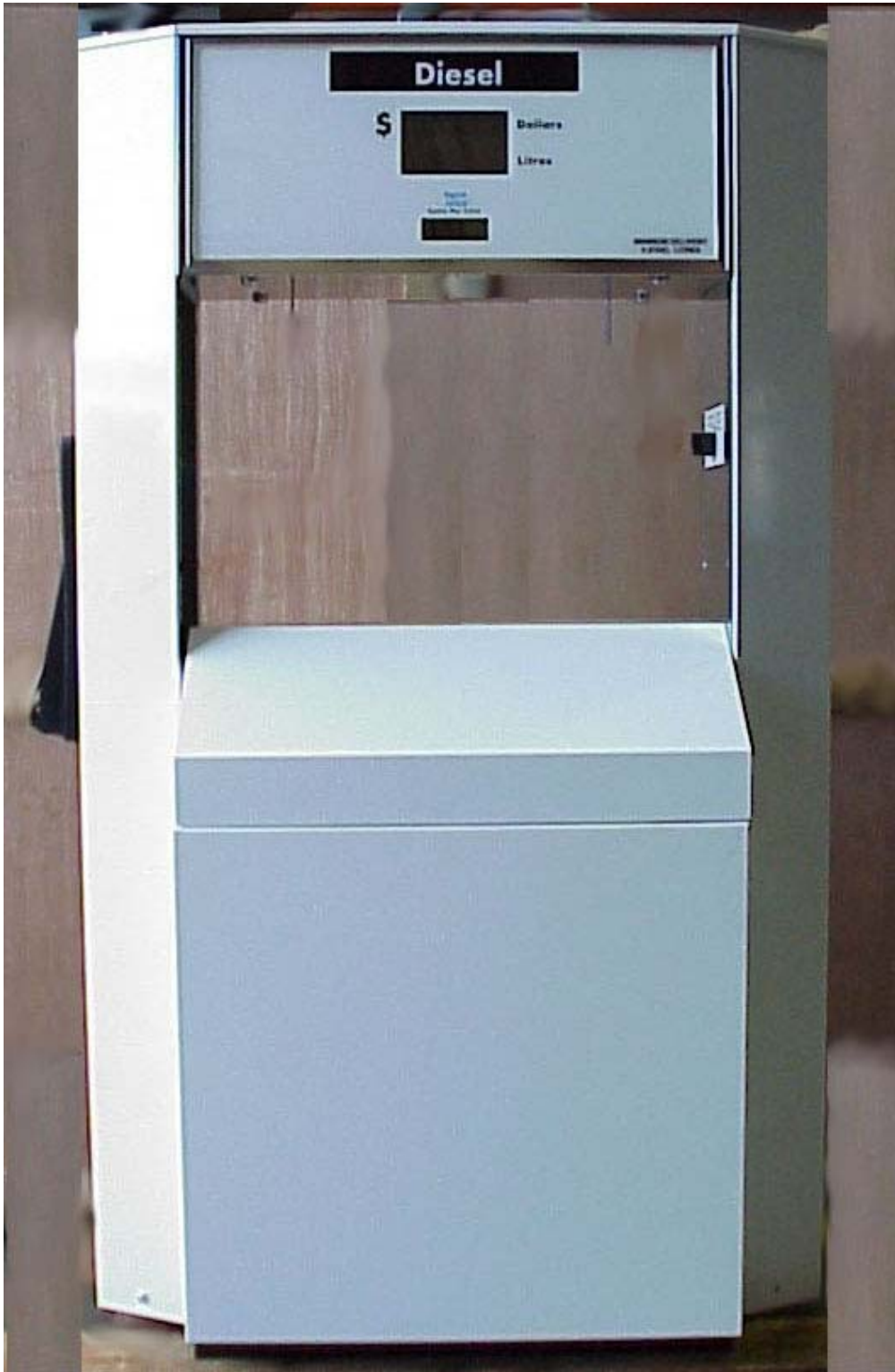
Transponder Technologies Model VNP1BUH Fuel Dispenser