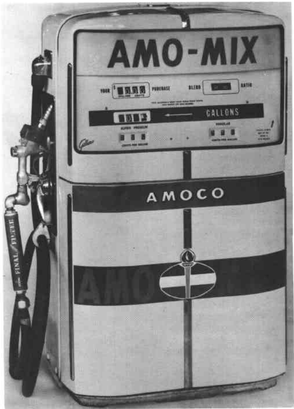
FIGURE 1 - The Pattern