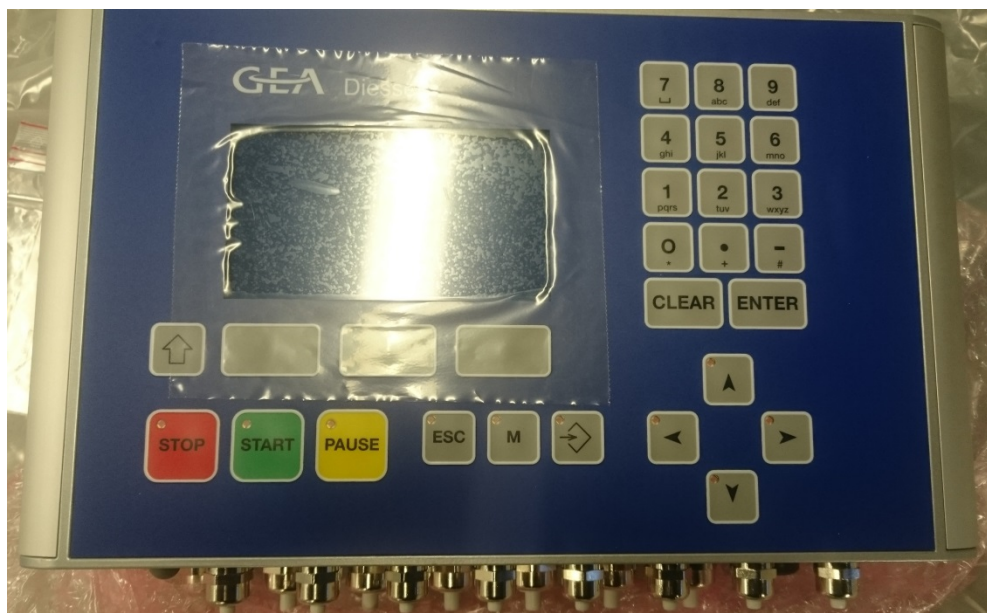
GEA Diessel Model Zevodat-Flash Calculator/Indicator