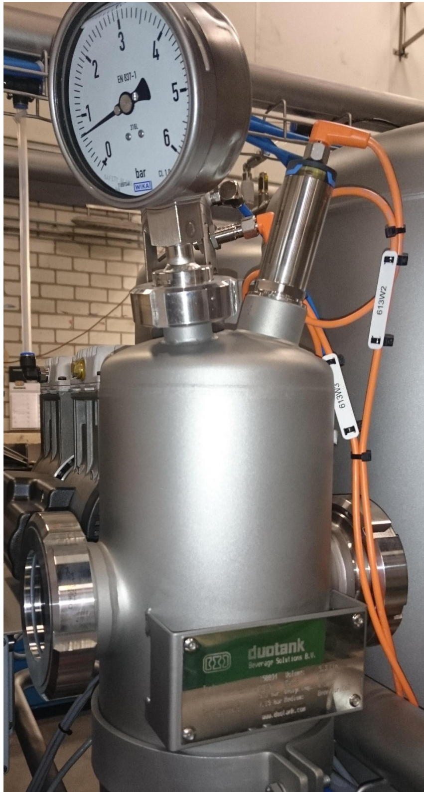
Duotank International Group B.V Float-operated Gas Separator