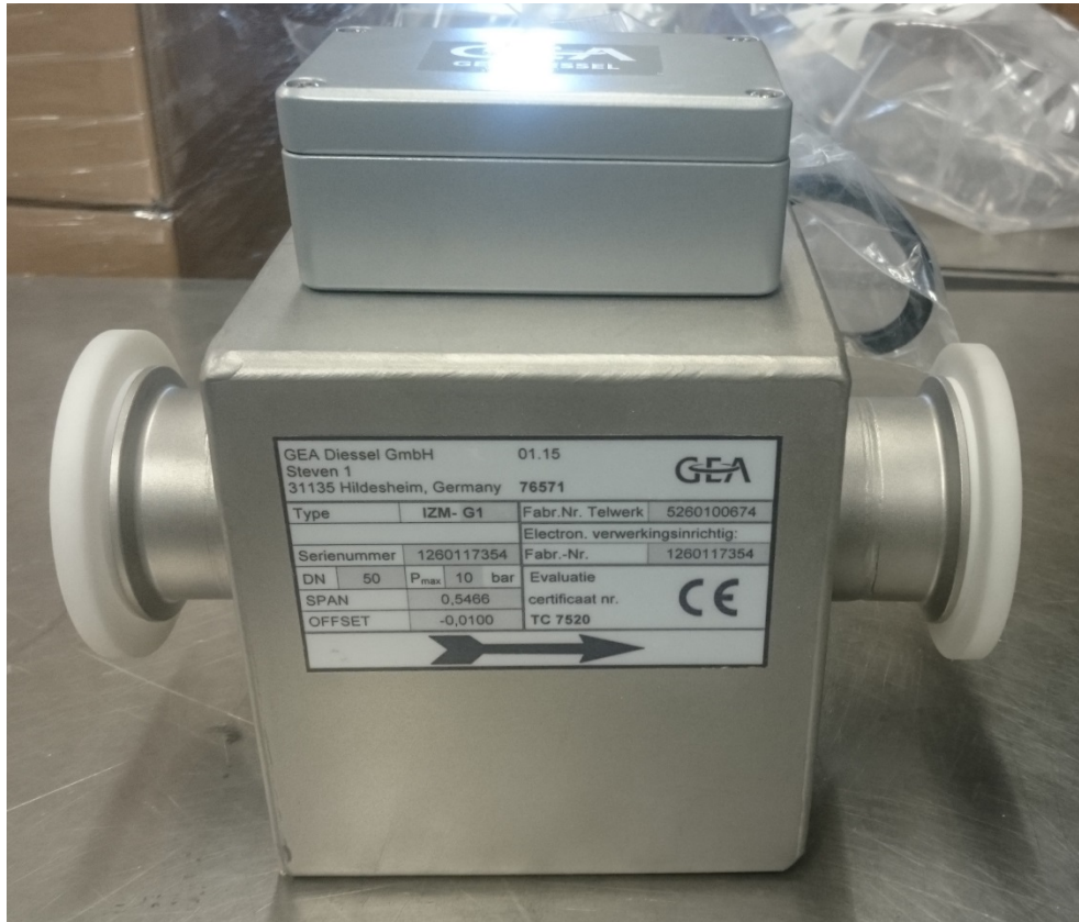
GEA Diessel Model IZM-G1 DN25 Electromagnetic Flowmeter