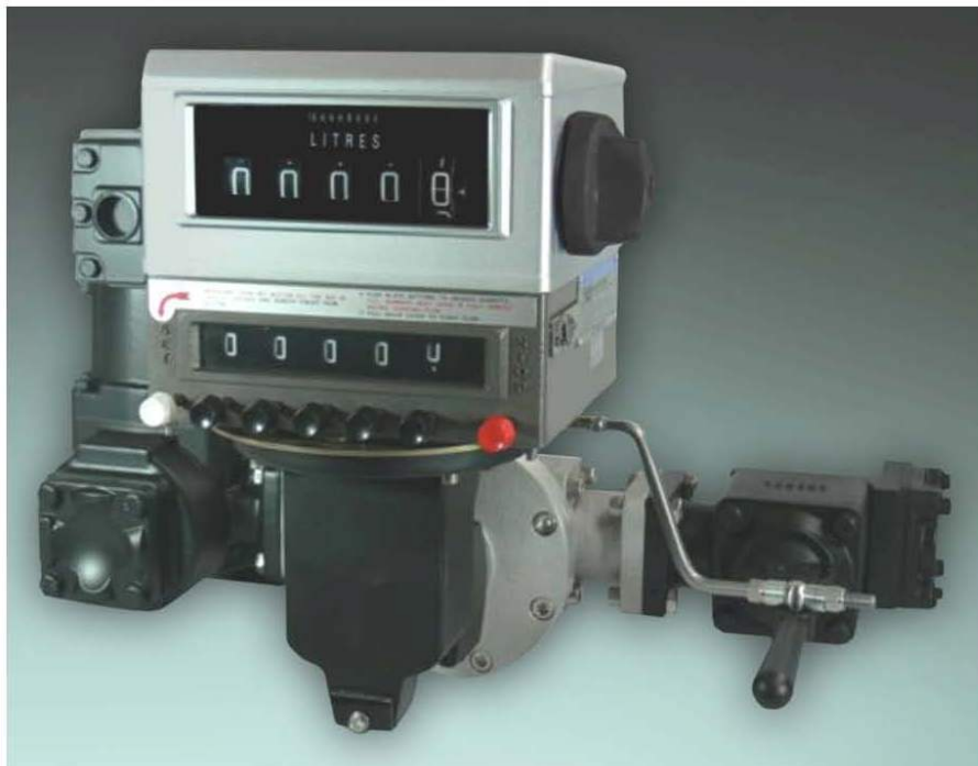
Typical Pre-set Device and Pre-set Counter Arrangement