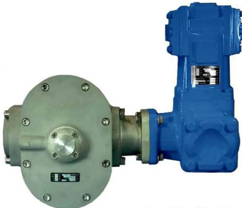
Trimec Model Flomec OM100 Flowmeter With Gas Elimination Device