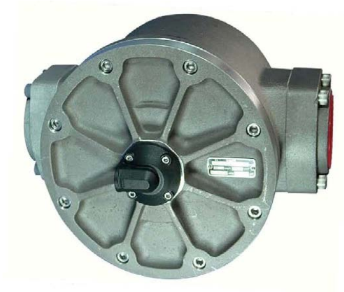
Trimec Model Flomec MG100 Series Flowmeter