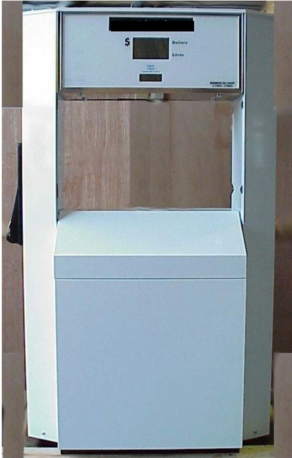
Transponder Technologies Model VNP1B-E Fuel Dispenser