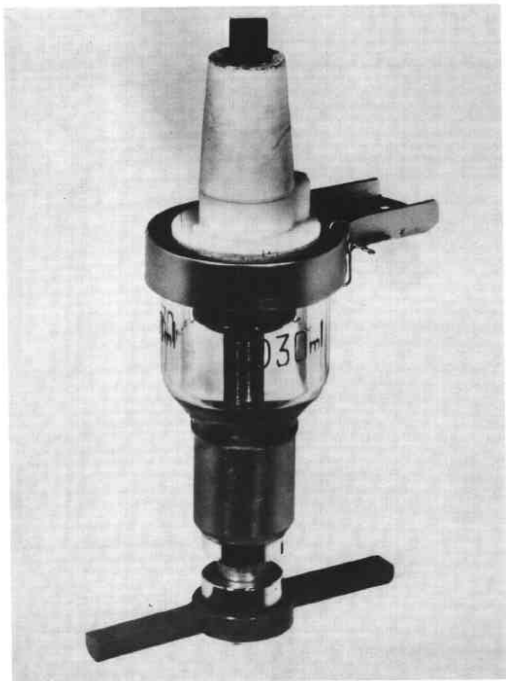
JD UDM 30-ml Liquor Dispenser