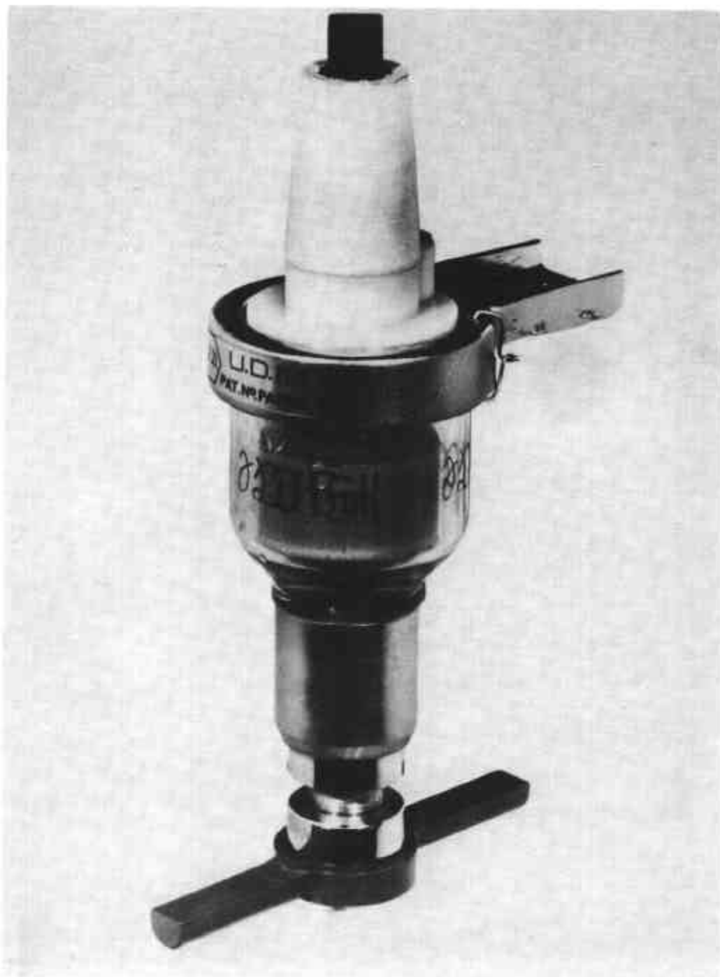
JD UDM 15-ml Liquor Dispenser