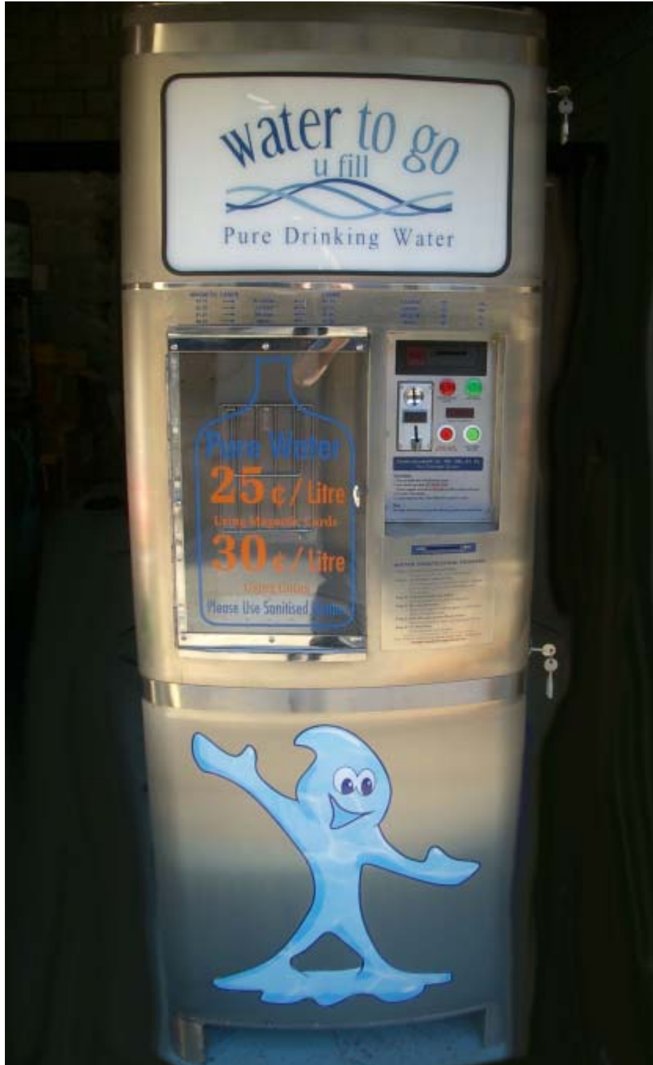
Water U Fill To Go Model DFSS 1700 Water Dispensing Instrument