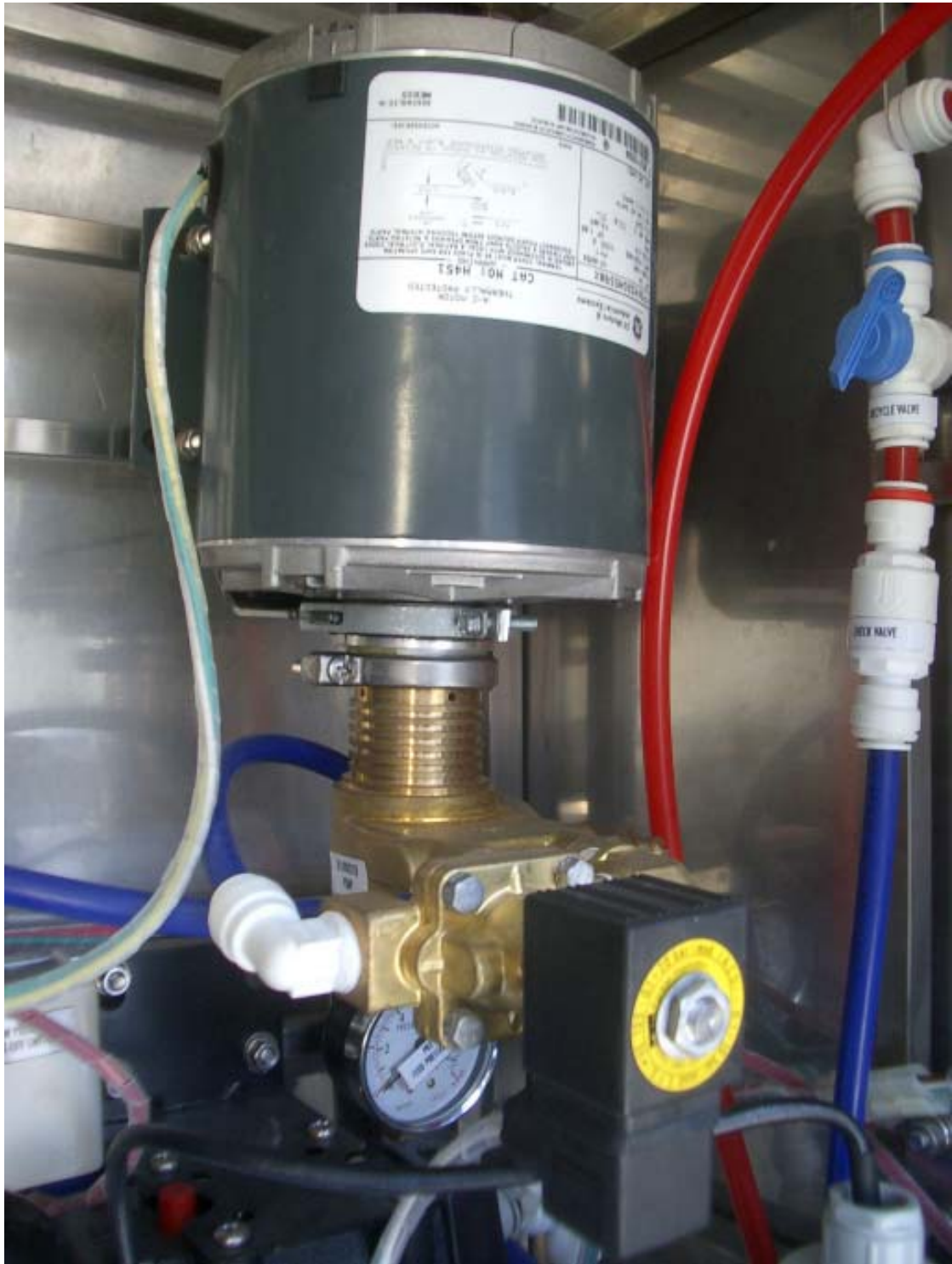
Shurflo Model 2088-592-094 Pump