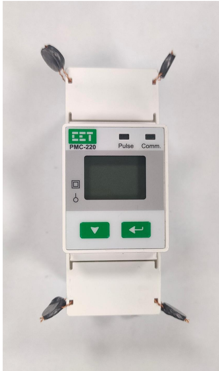
CET Electric Technology Inc. model PMC-220-A6 Class 1 Electricity Meter (the pattern, including typical mechanical sealing)