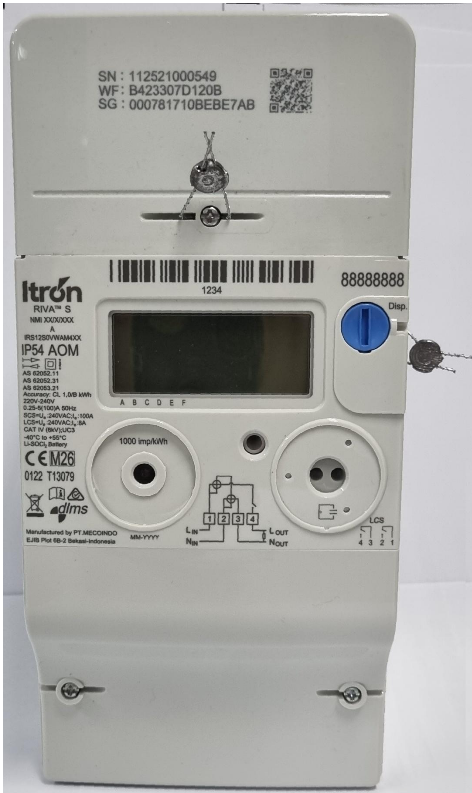
Itron model Riva S electricity meter