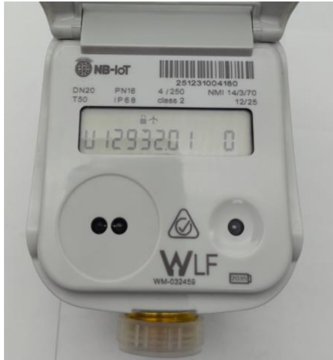
Sanchuan DN20 Series Ultrasonic Water Meter – Indicating device