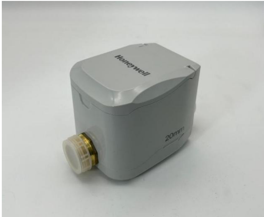
FIGURE 14/3/70 – 7