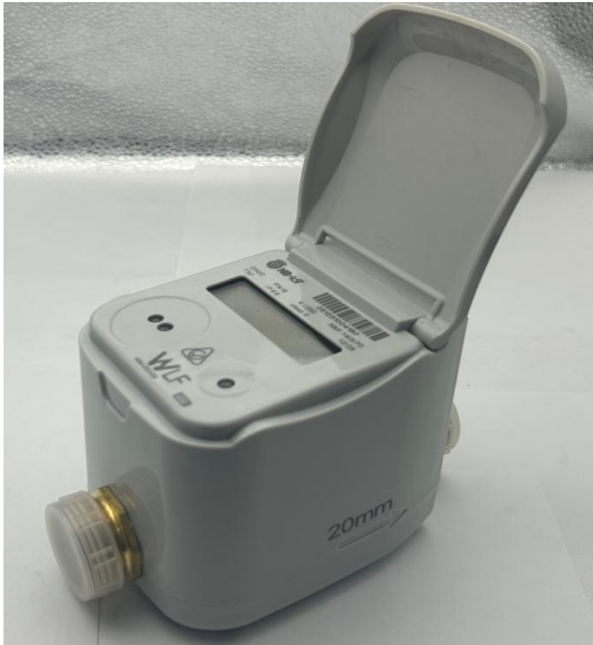
Sanchuan DN20 Ultrasonic water meter – (the Pattern)