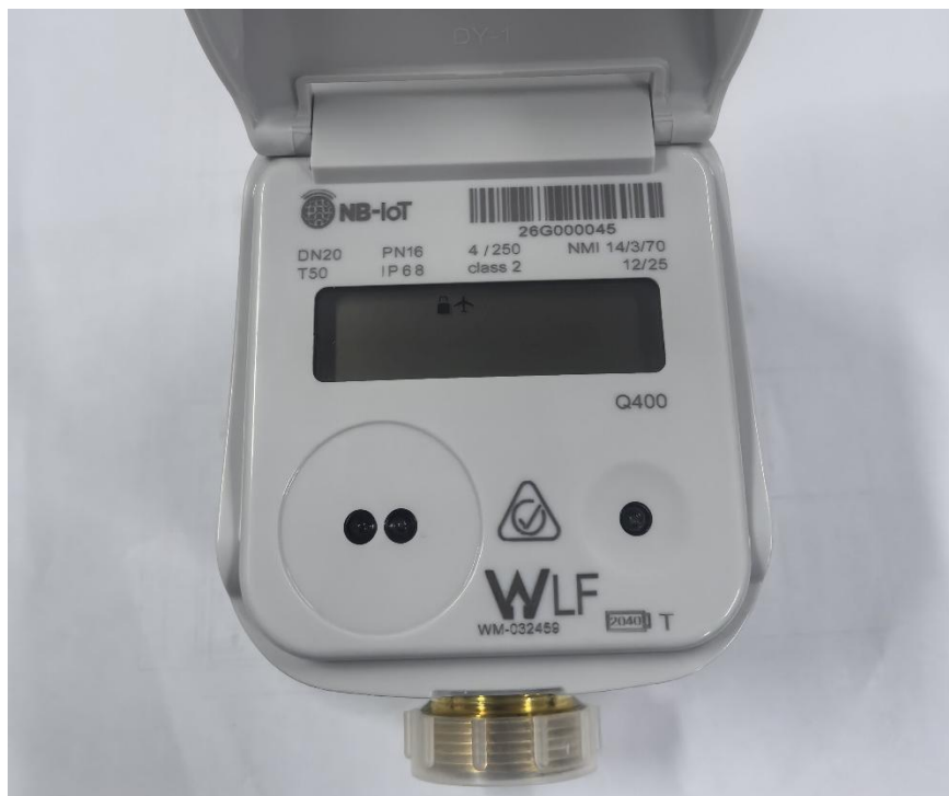
Alternative branding – Elster Honeywell Q400 (Variant 3)