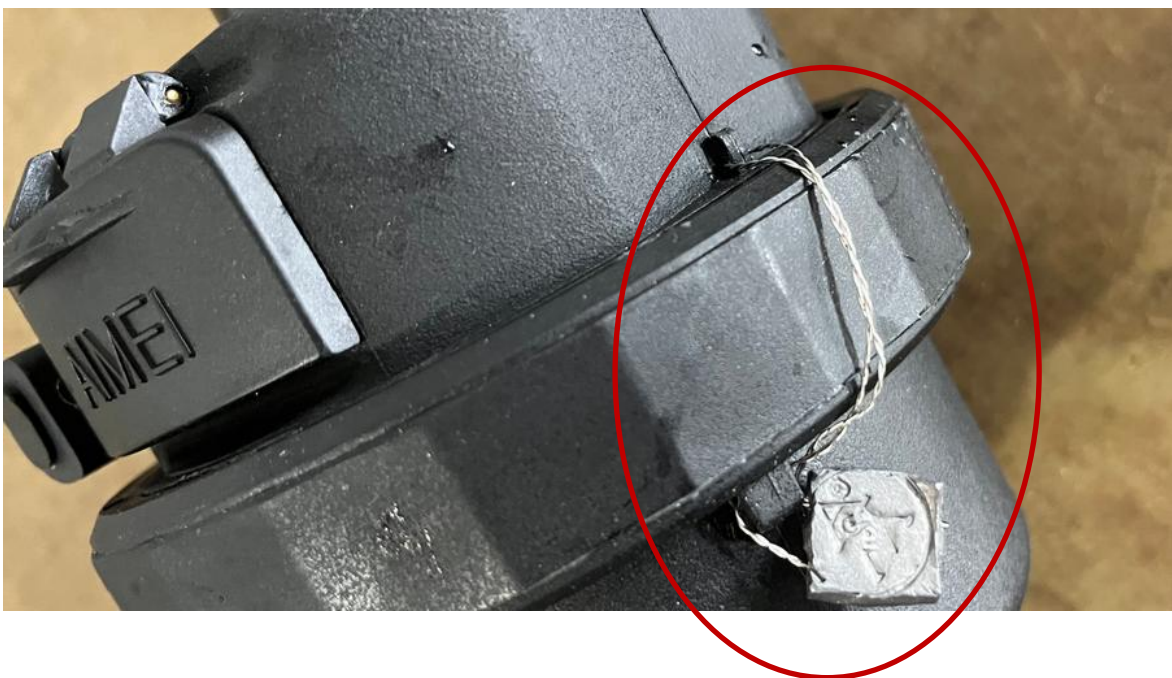
Showing Descriptive Markings and Alternative Lead Wire Mechanical Sealing