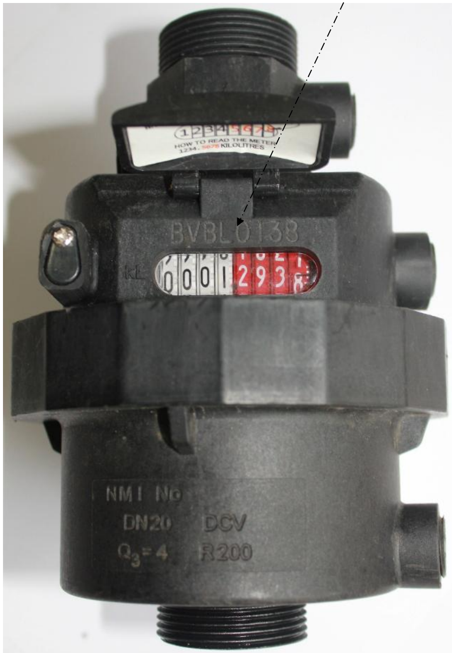
Global Valve Technology (GVT) model TPWM 20 mm Water Meter (the pattern)