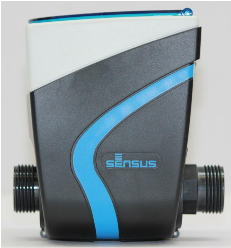
Sensus Model iPERL DN20 Water Meter (The Pattern – Side View)