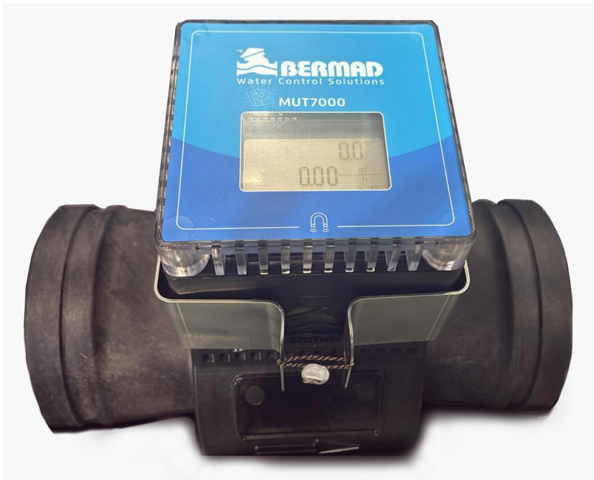
FIGURE 14/3/79 – 3