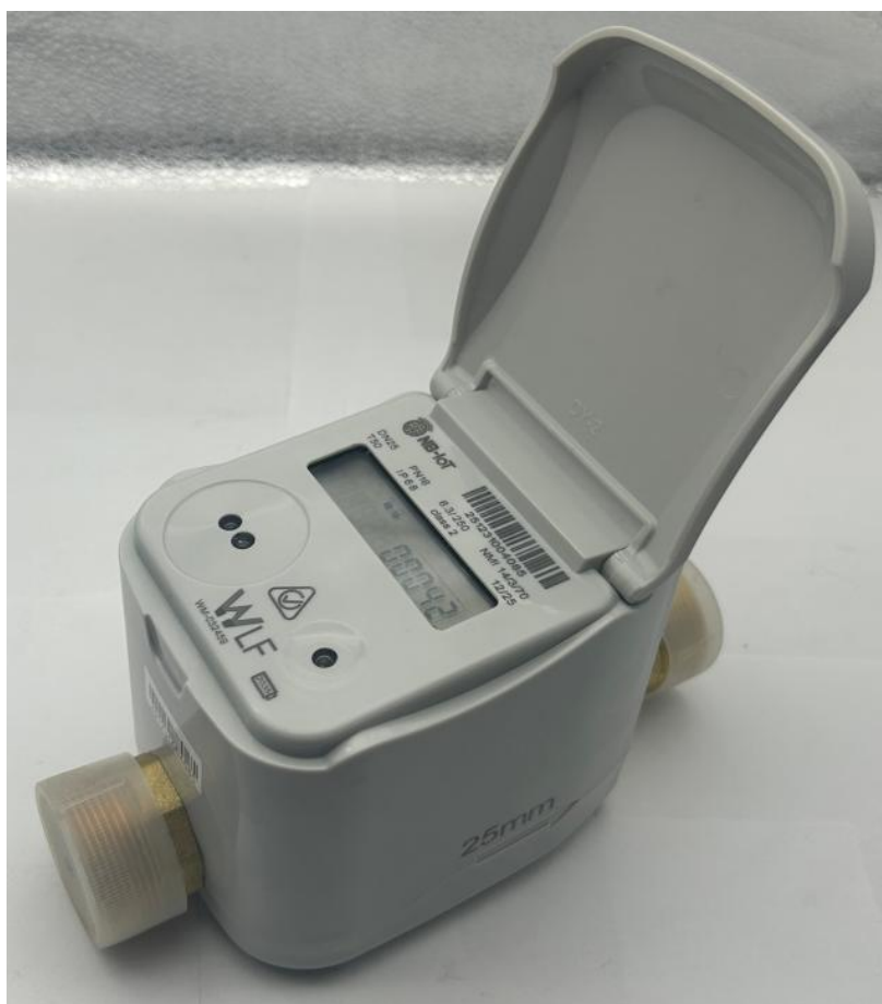
Sanchuan DN25 Ultrasonic Water Meter – (Variant 2)