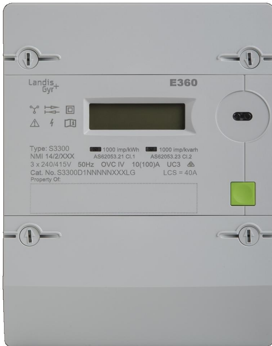
Landis+Gyr Pty Ltd model E360 (Series 1) Type S3300 Electricity Meter (Variant 1)