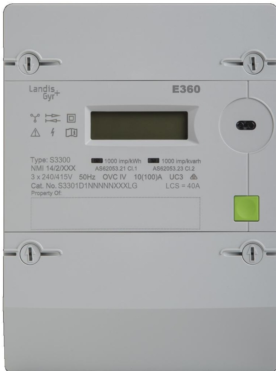
Landis+Gyr Pty Ltd model E360 Type S3301 Electricity Meter (Variant 2)