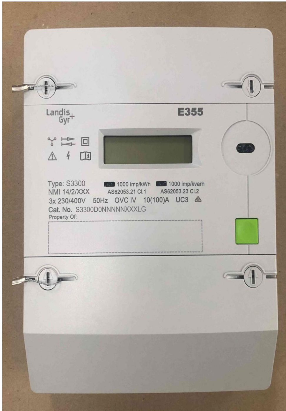
Landis+Gyr Pty Ltd model E355 Type S3300 Electricity Meter with 230 V (Including Typical Mechanical Sealing)