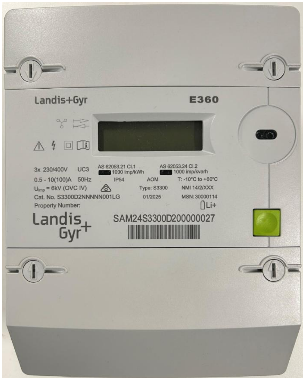
Landis+Gyr Pty Ltd model E360 Type S3300 Electricity Meter (Variant 3)