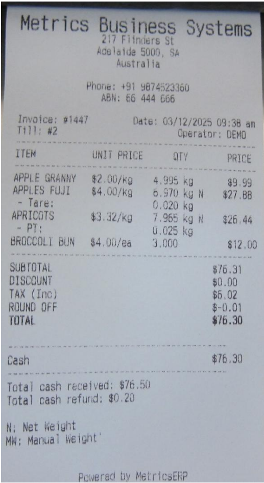
FIGURE S796 – 3