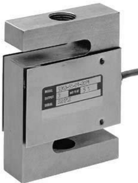
(a) Revere Transducers Model 9363 S-type Load Cell