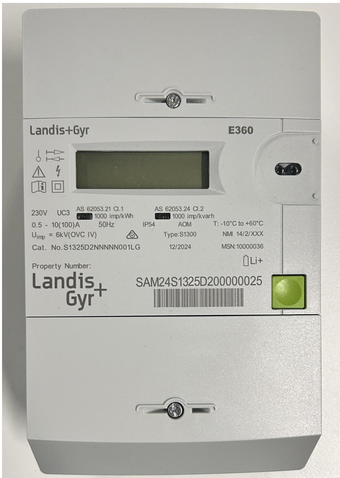
Landis+Gyr Pty Ltd Type S1325 (Series 2) Electricity Meter (Variant 4)