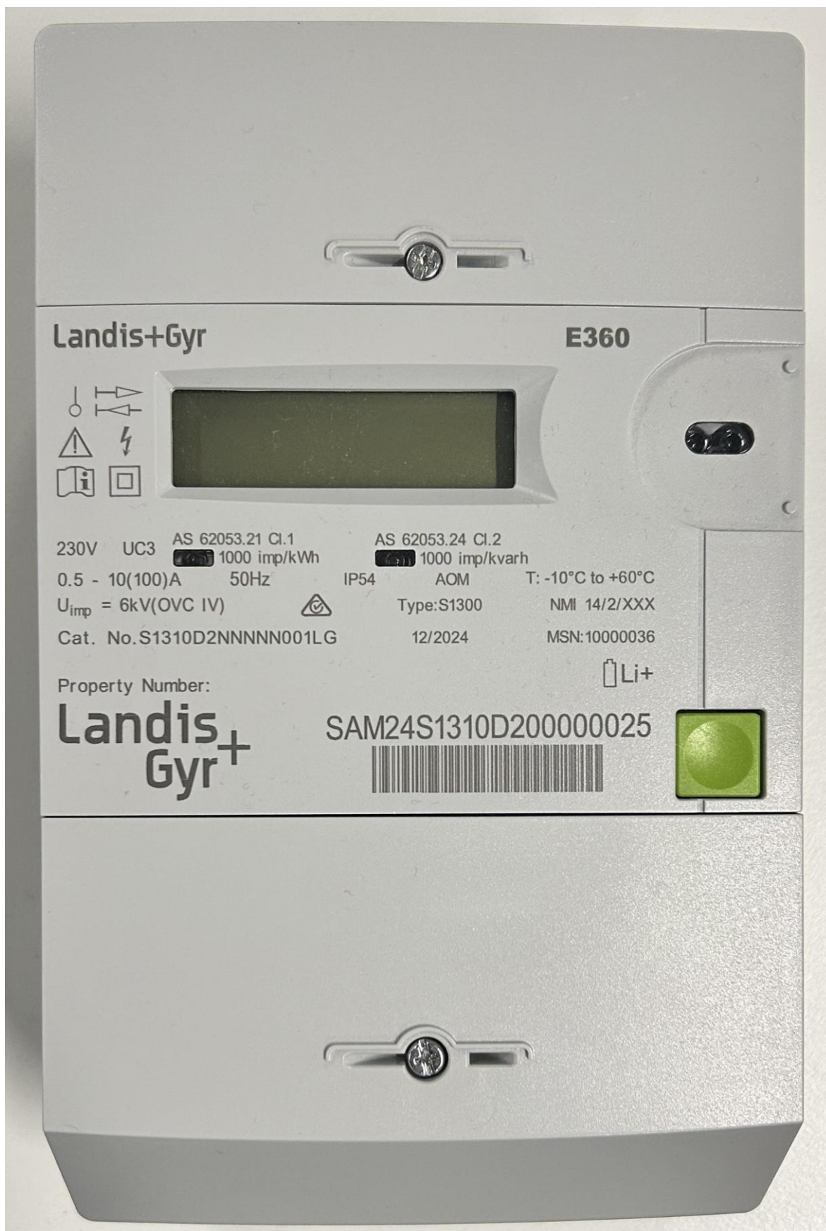
Landis+Gyr Pty Ltd Type S1310 (Series 2) Electricity Meter (Variant 3)