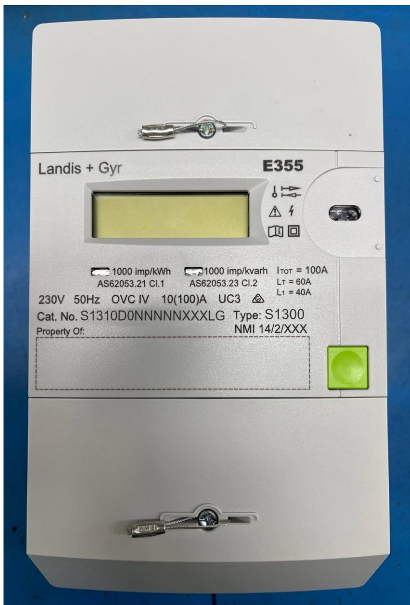
Landis+Gyr Pty Ltd model E355 Type S1310 Electricity Meter (Including Typical Mechanical Sealing)