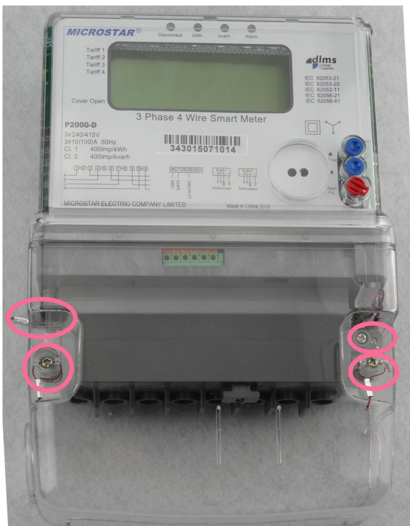
Microstar Model P2000-D (Including Typical Mechanical Sealing)