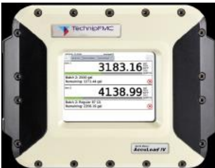
Smith Meter™ AccuLoad IV Model ALIV-ST Controller for Liquid-measuring Systems