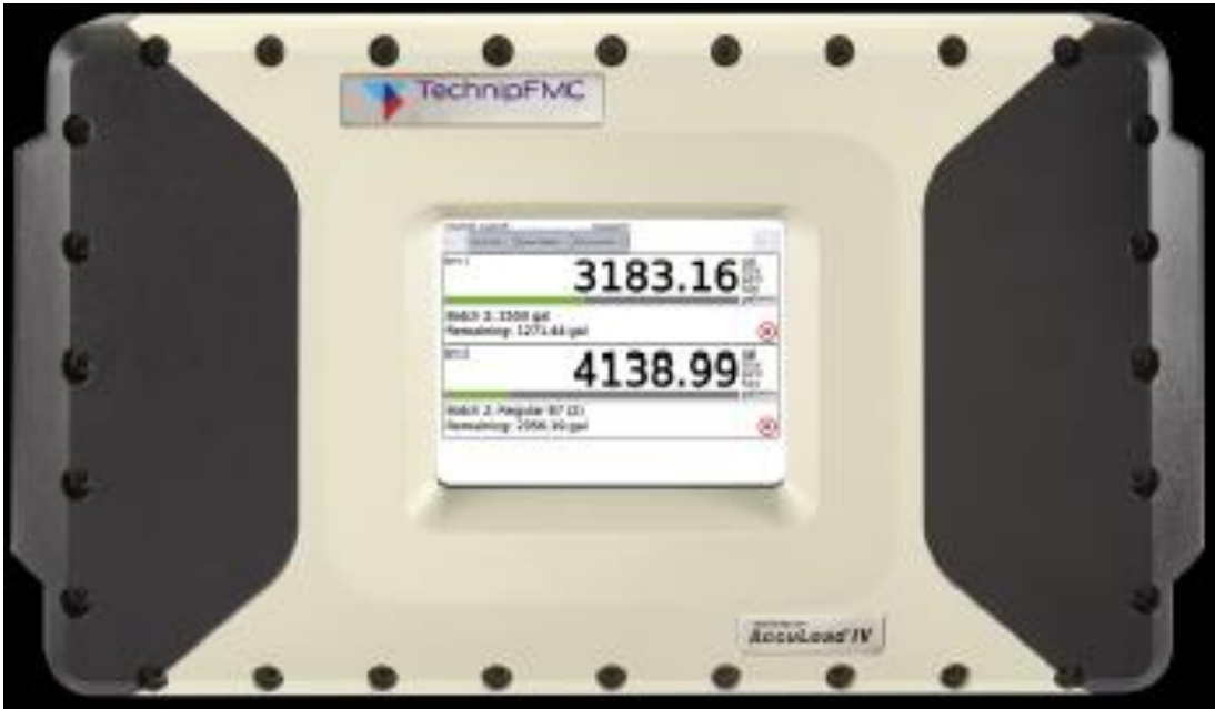
Smith Meter™ AccuLoad IV Model ALIV-QT Controller for Liquid-measuring Systems