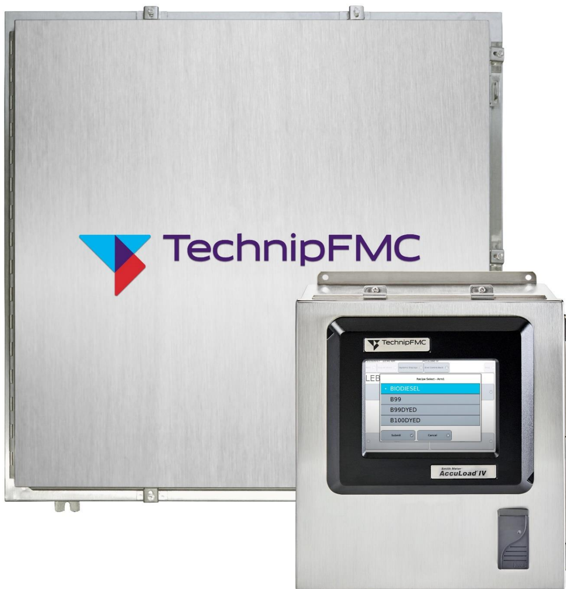
FIGURE S742 –5

Smith Meter™ AccuLoad IV Model ALIV-N4-MMI (foreground) and ALIV-FCM Controller for Liquid-measuring Systems (Variant 2)