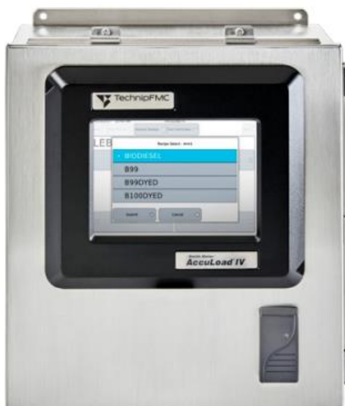
FIGURE S742 – 4