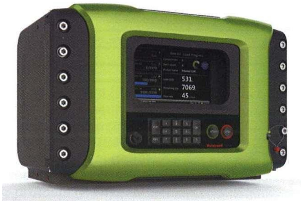
Simth Meter Model Fusion4 MSC-L Calculator/indicator