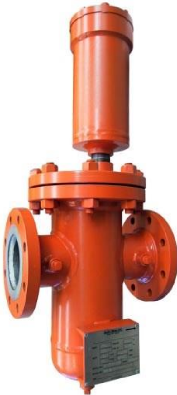
Smith Meter Inc 100 mm Strainer/Gas Purger