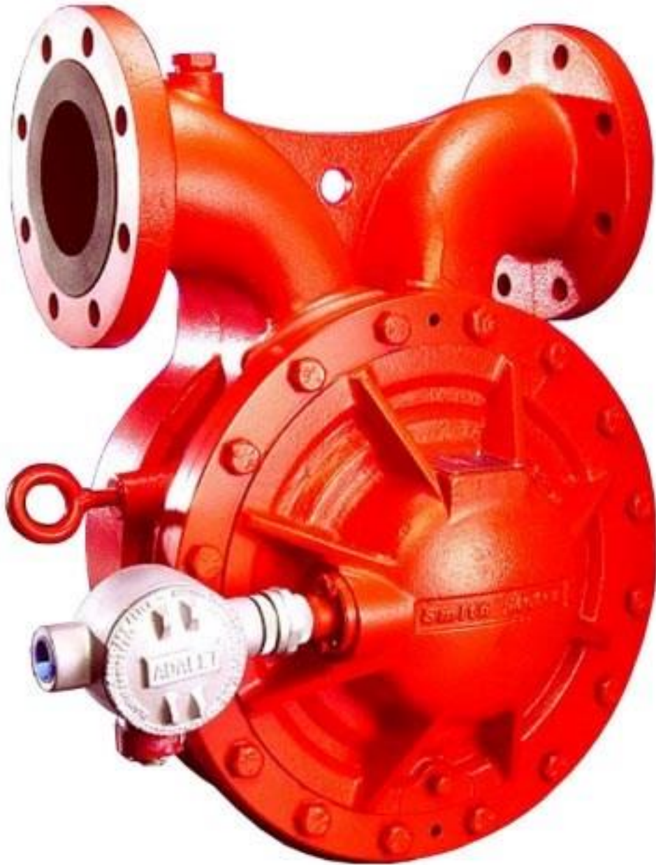
Smith Meter Inc model PRIME 4-B-1-1-0-0 100 mm Flowmeter