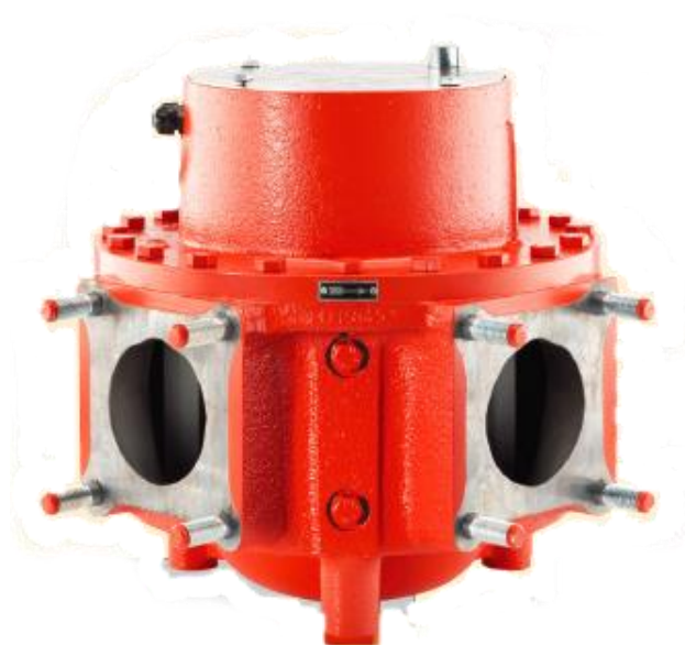
Smith Model T-20 Flowmeter (Variant 1)