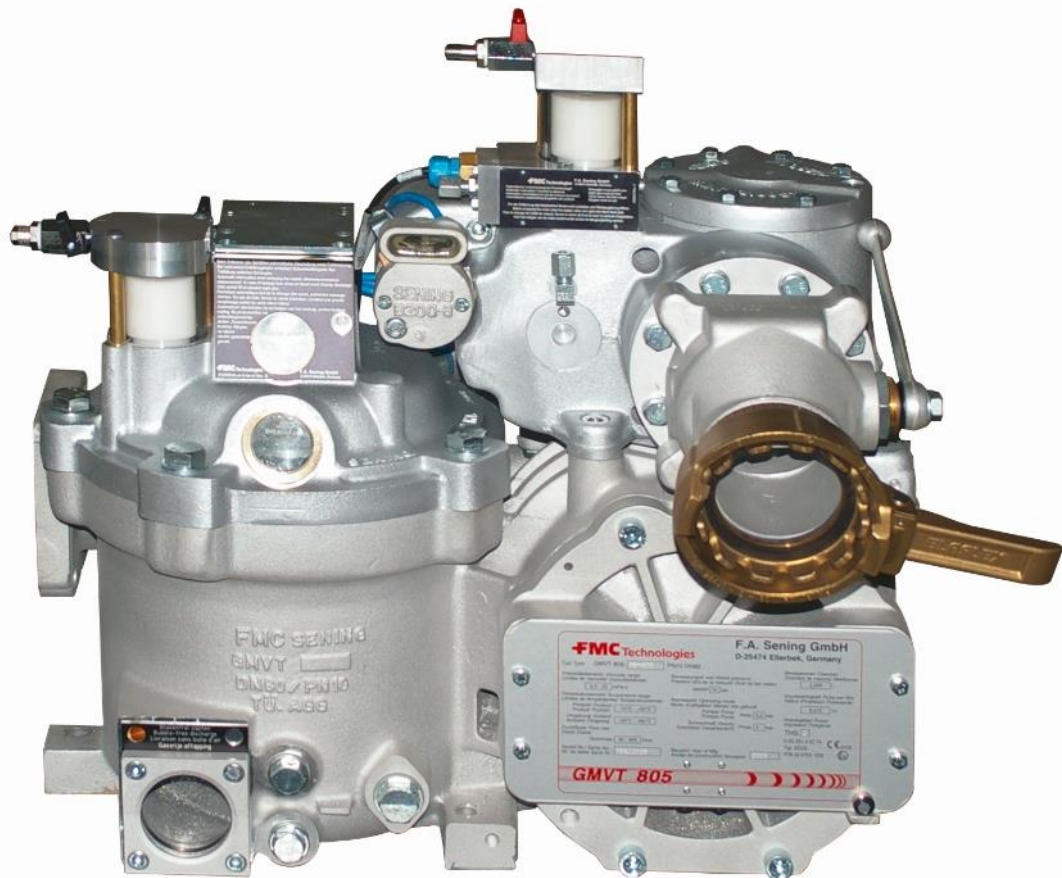
F.A. Sening Model GMVT 805 Flowmeter