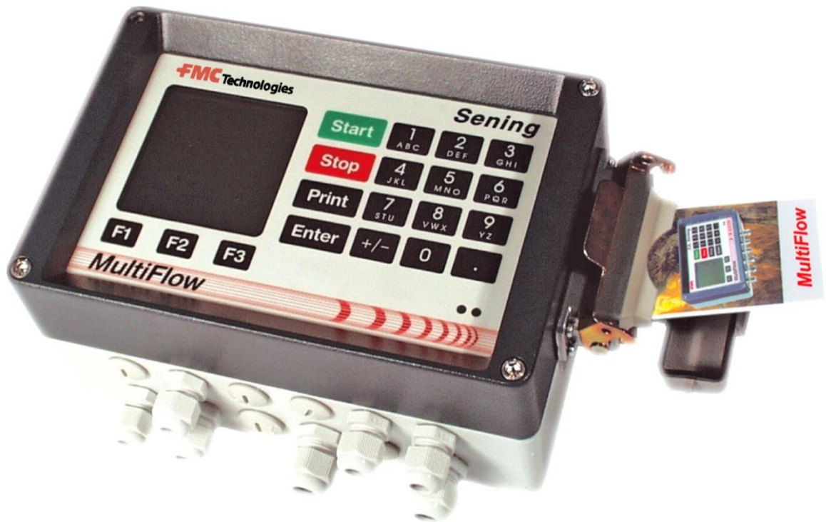
F.A. Sening Model MultiFlow Calculator/Indicator