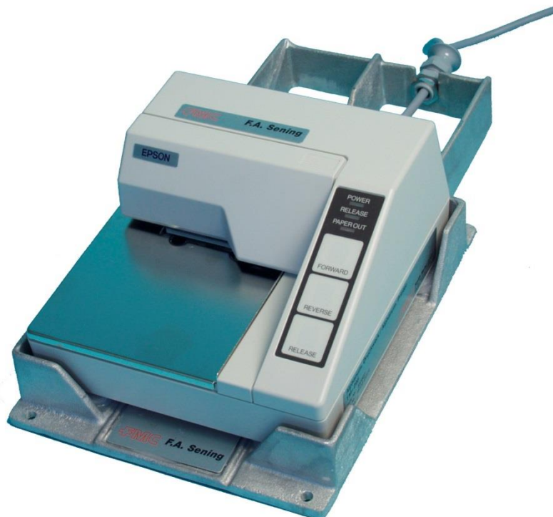
Epson Model TM-295 Printer